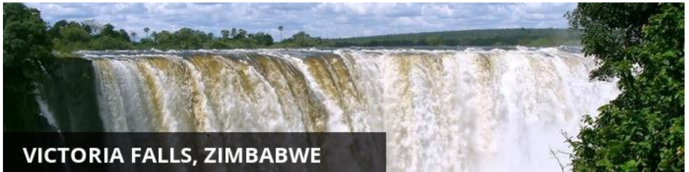
VICTORIA FALLS, ZIMBABWE