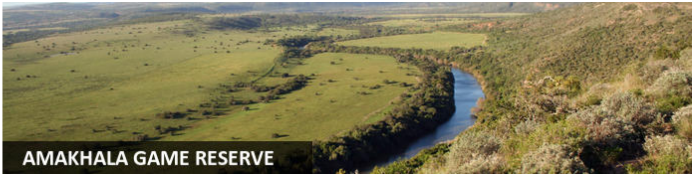
AMAKHALA GAME RESERVE