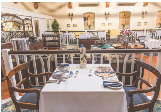
BUFFET LUNCH SERVED IN THE CREST RESTAURANT Delectable dishes on offer. Specific requirements can be catered for...