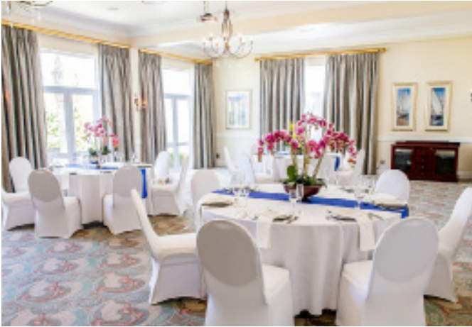
BANQUETING SET-UP Ideal for large product launches...