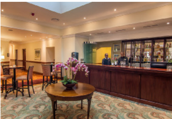
THE CONFERENCE BAR Perfect for after conference drinks or cocktail functions...