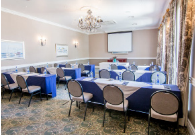
CLASSROOM SET-UP Ideal for large presentations...

ALL CONFERENCING PACKAGES INCLUDE THE USE OF THE VENUE AND THE USE OF STANDARD EQUIPMENT WHICH INCLUDES THE FOLLOWING: