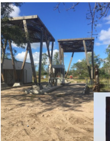
MSR Futi Entrance

Maps: <<< Catembe to Anvil Bay (Time is for tar road conditions) Maputo to MSR Futi Gate>>>