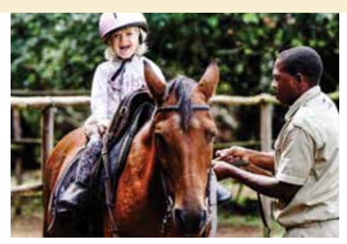
Kiddies Pony Rides ± 15-minute walk around the Rest Camp Led by guides, <6 years

Explore Mlilwane's great diversity of habitats including riverine, forest, mountain, aquatic and grass savanna plains on horseback. All horse trails are guided. All activities depart from Reception, have safety requirements and are weather-dependent Indemnities and honest communication of experience required