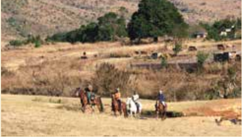
Swazi Culture and Scenery Trail 4 nights / 5 days. Plains, Nyonyane Mountain, river crossings, highveld & rural community Bow tent fly-camps 11h00 depart; 14h00 return, 4 – 8 pax; 8+ years April - October, 1 week advance booking Moderate to experienced riders

WHAT TO BRING ✓ An adventurous attitude ✓ Neutral coloured clothes ✓ Tight fitting, comfortable, long trousers ✓ Loose, light shirts, preferably with long sleeves to prevent sunburn ✓ Closed shoes with a heel, (suitable for riding & walking) ✓ Helmet & sun hat ✓ Sun cream ✓ Insect repellent ✓ Personal toiletries ✓ Swimming costume and towel ✓ Camera (not large!) ✓ Torch ✓ Optional - sleeping bag, snacks, alcohol, basic medical kit, reading material (2< night trails)</li>