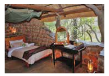
TWIN UNIT [5] 2 single beds