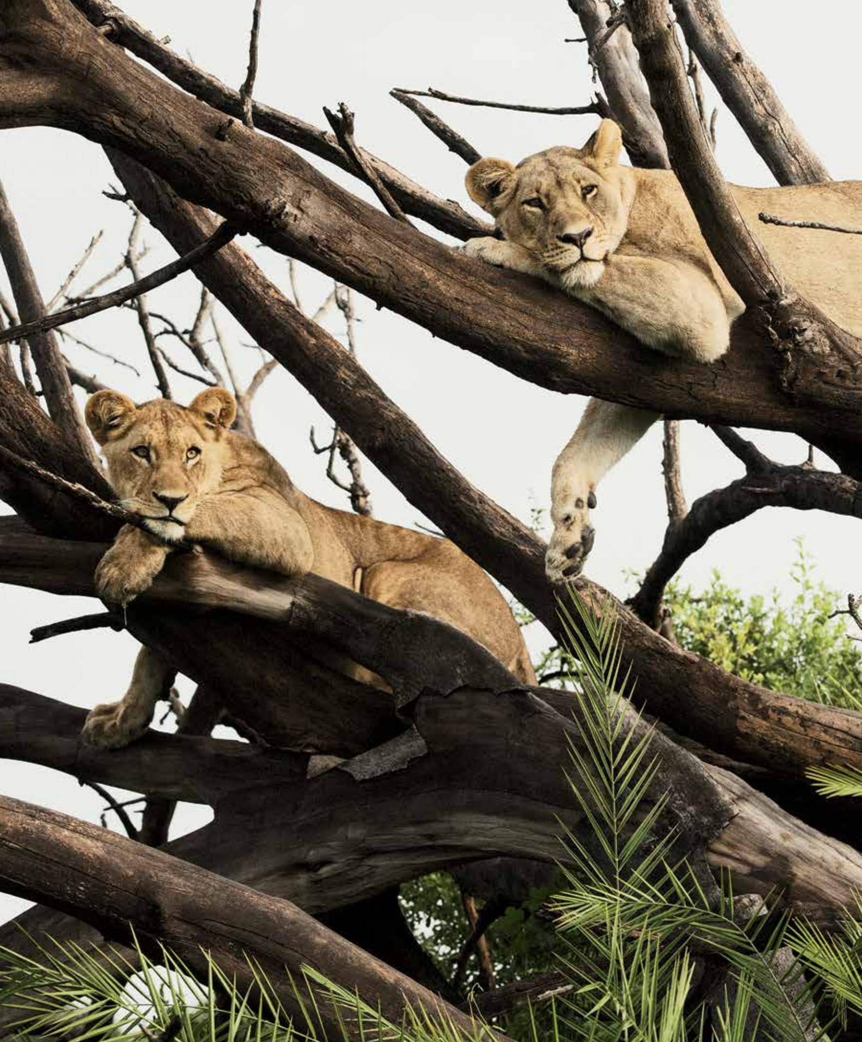
Opposite: Two young lionesses rest on a tree close to Duba Plains Camp.