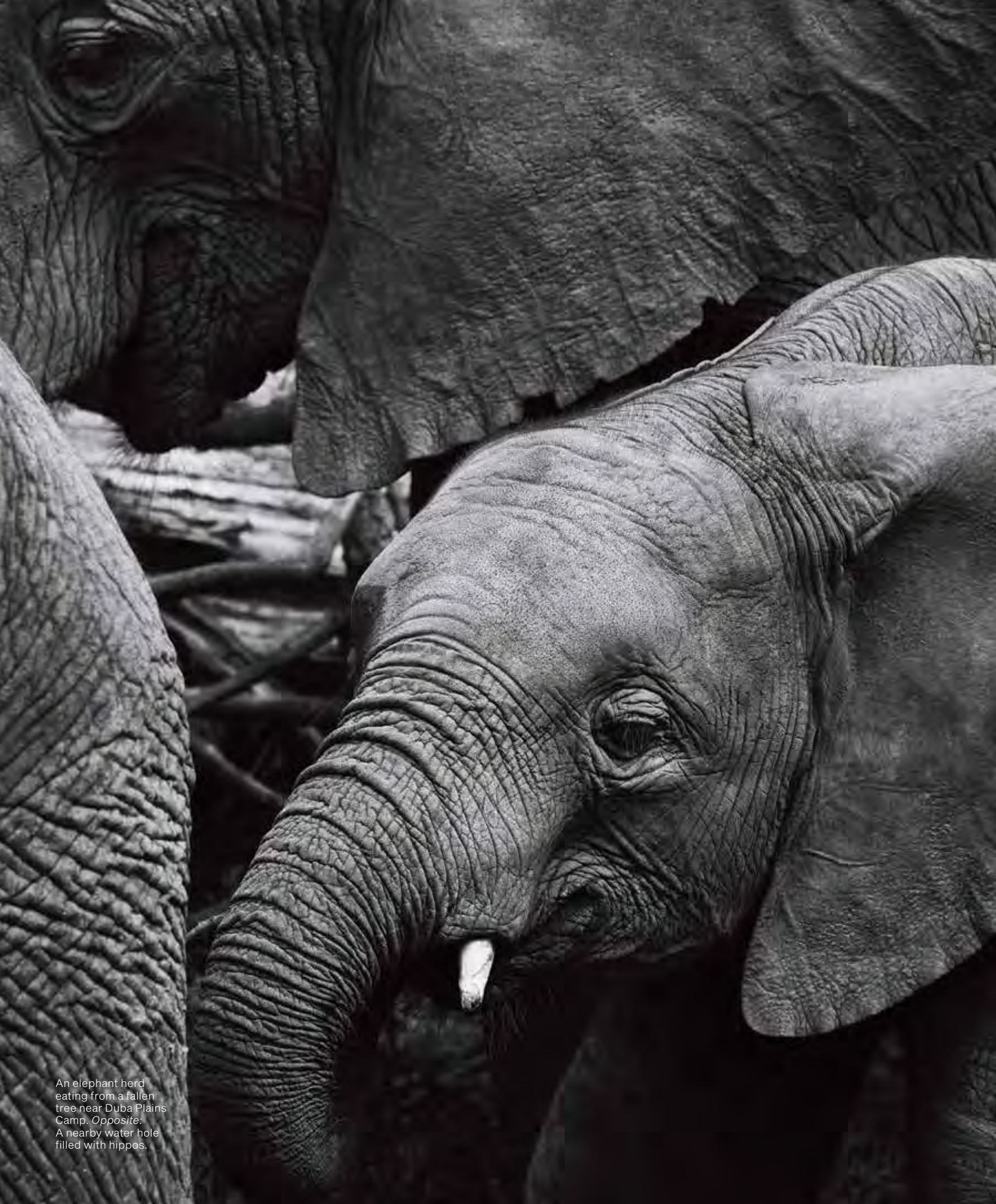
An elephant herd eating from a fallen tree near Duba Plains Camp. Opposite: A nearby water hole filled with hippos.