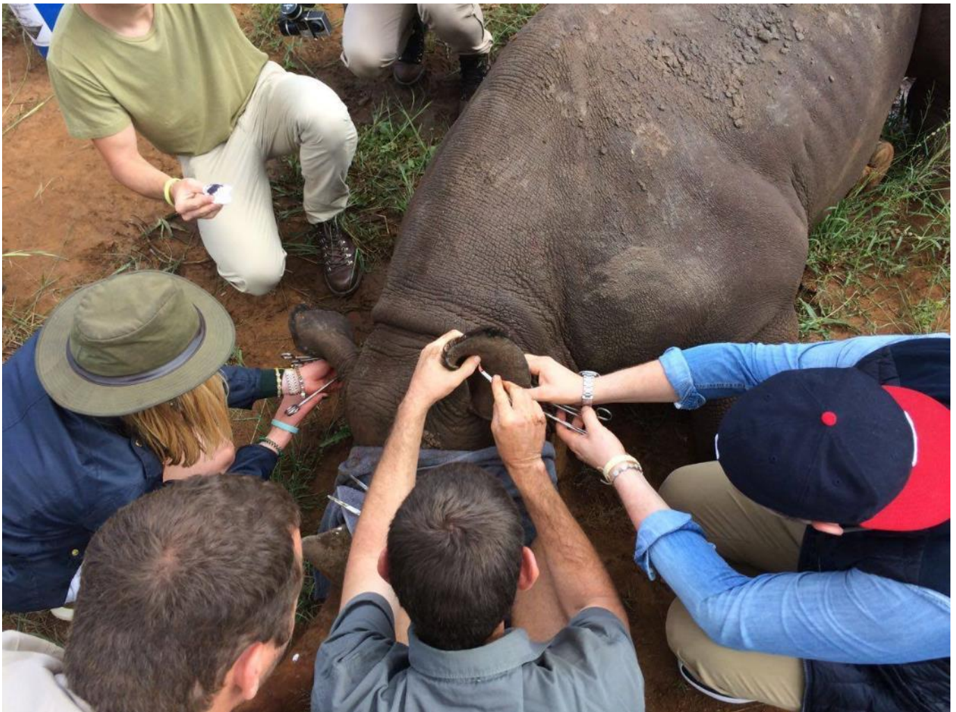
Rhino notching procedure

Afterwards you will enjoy a nice breakfast (at the house or in the bush) and you will have time to relax and enjoy the pool. In the afternoon you will enjoy lunch and another afternoon game-drive , followed by dinner.