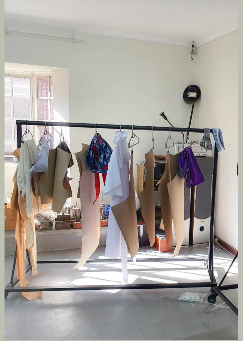
FASHION SHOW COMING SOON