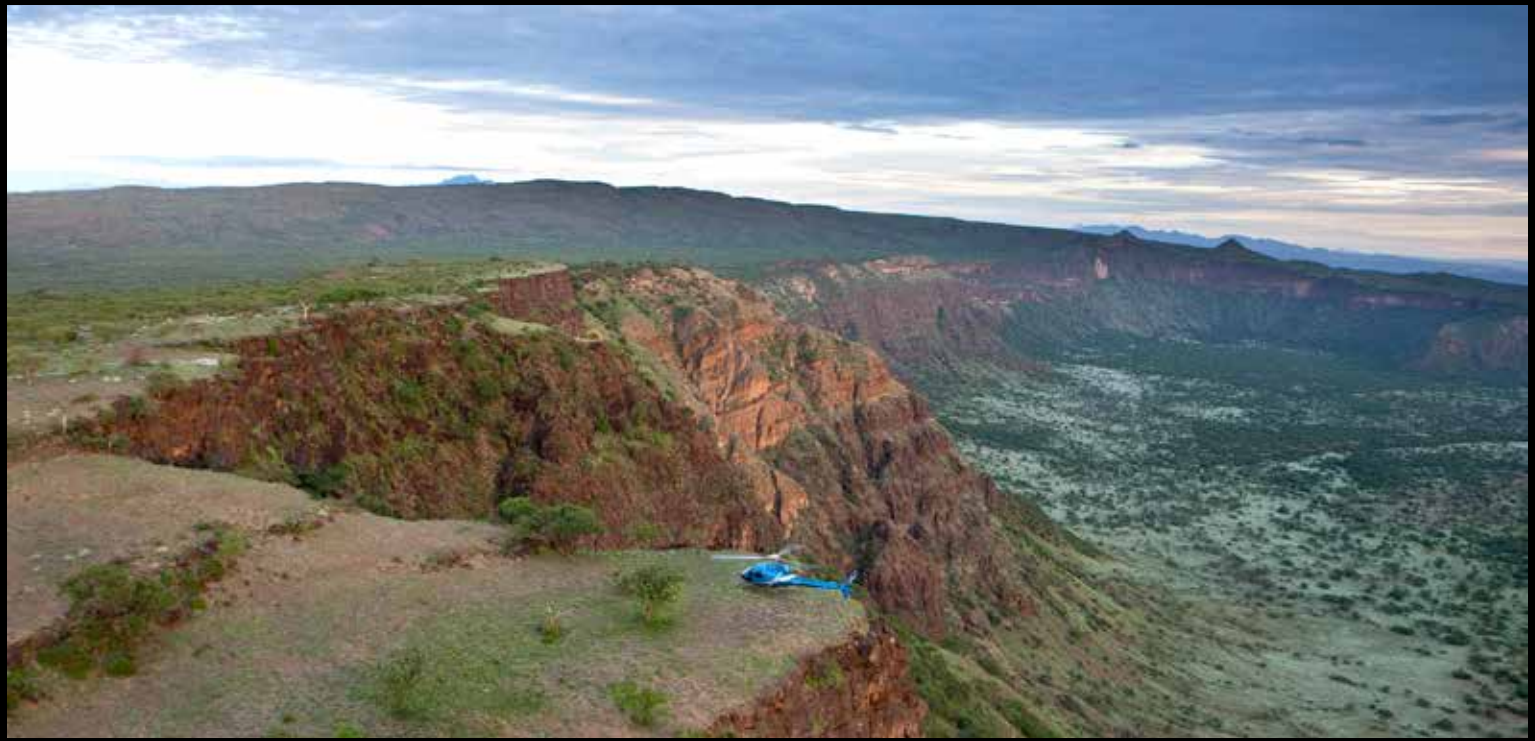
A vast caldera, carpeted by grasses and shrubs.