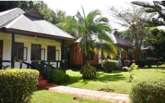
Days 2-5: Ndutu Wilderness Camp, Ndutu

Today starts with an early morning visit to one of the natural wonders of the world, the volcanic caldera of Ngorongoro, which offers spectacular game viewing. We can almost guarantee you four of the Big Five will show up, as well as a rich variety of birds, all viewed against the backdrop of the thickly forested crater walls. Varied terrains and dramatic landscapes consisting of forest, grasslands and both freshwater and soda lakes make the Ngorongoro Crater a true marvel of creation.