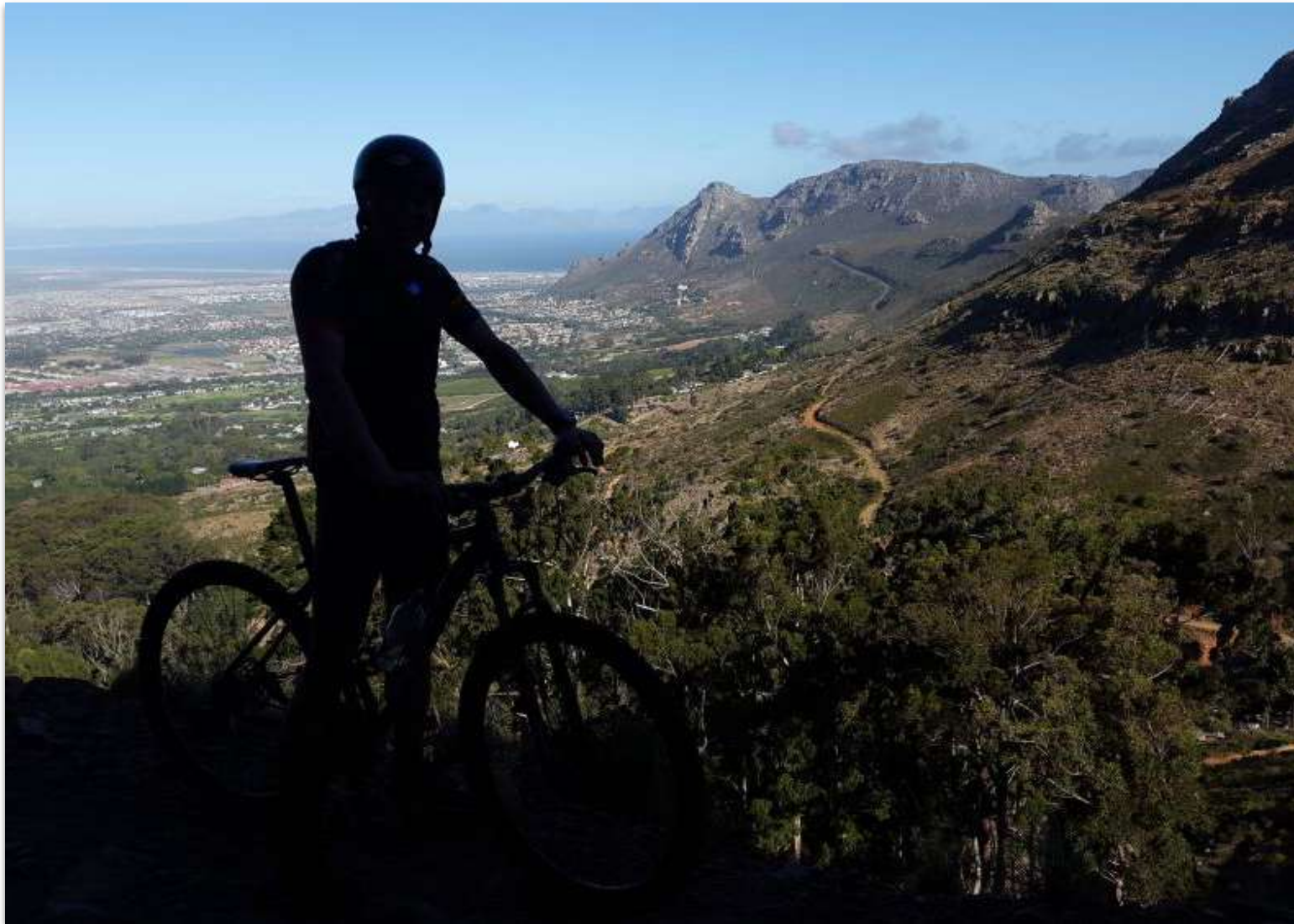
TABLE MOUNTAIN BIKING ADVENTURE - R 1,625 per person

This is an ideal way to experience the glorious nature of Table Mountain. We guide you on the 'Double Descent' route on the lower slopes offering fantastic panoramic views. This adventure is suitable for experienced cyclists as well as those who want to try off-road biking.