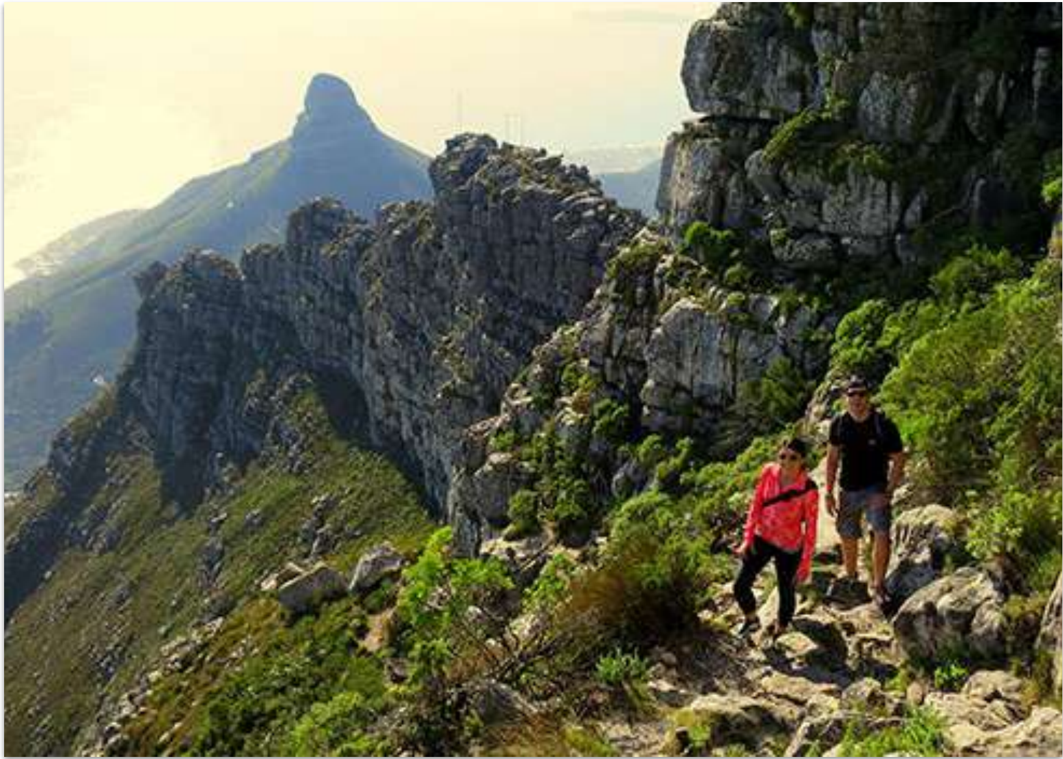
TABLE MOUNTAIN HIKING ADVENTURE - R 1,510 per person

There are a number of fantastic hiking routes to the summit of Table Mountain that require moderate fitness and offer an extraordinary nature experience right in the heart of the city. Your expert guide will ensure your safe passage to the top of this iconic mountain. If you find you are too tired to walk down, you have the option of taking the cable car (for guests' own account).