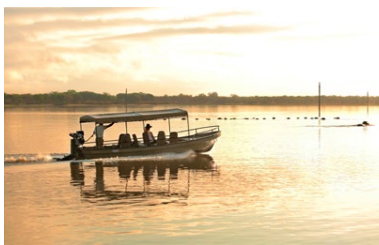
Day 3 & 4: Overnight at Roho ya Selous, Selous Game Reserve

Your days on safari offer plenty of flexibility, with a range of safari activities to choose from each morning and afternoon. Walking safaris are entirely different here to those in Ruaha, exploring the miombo woodland environment with your guide. In the early mornings, the light is particularly beautiful in the Selous, making for some great photography opportunities as you look for tracks of wildlife that have come near camp overnight. The boat safaris are superb