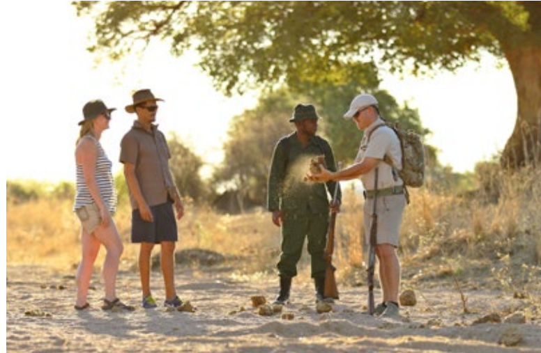
Day 6 & 7: Overnight at Jabali Ridge, Ruaha National Park

Depending on your preference, there are a couple of options with regards to how your day is structured. Walking safaris are a great way to start the day, getting out early and exploring the environment on equal footing as the wildlife. There are morning game drives with picnic breakfasts, or delicious breakfasts to be enjoyed in camp. Full day game drives with picnic lunches, or a relaxed lunch in camp with an afternoon game drive. Or