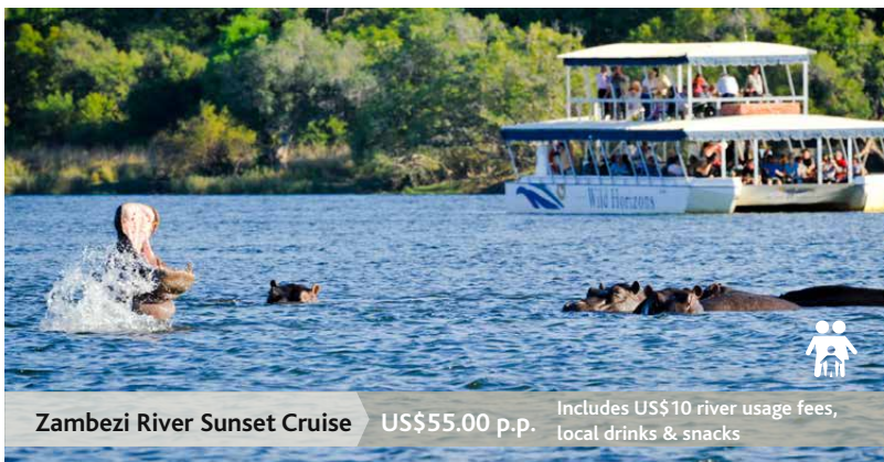
Zambezi River Sunset Cruise US$55.00 p.p. Includes US$10 river usage fees, local drinks & snacks