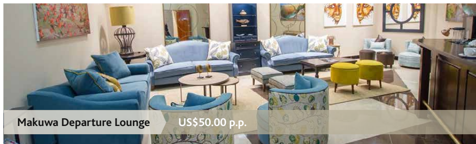
Makuwa Departure Lounge US$50.00 p.p.