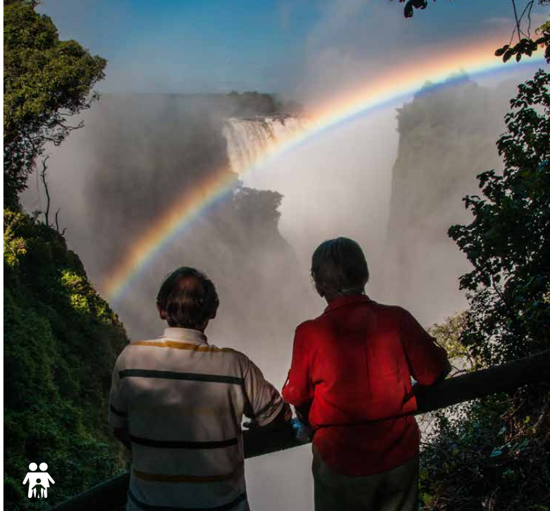
Tour of the Victoria falls US$51.00 p.p. Min 1 pax, Includes US$30 park fees