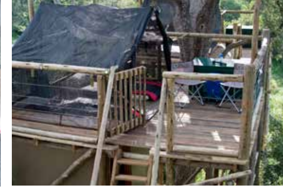
while you sit around the bonfire and enjoy the sights and sounds of nature.

Dinner is served at approximately 20h00 on the raised dining deck. Your meal is prepared by the guides over the open fire