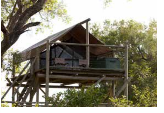
signal or wi-fi. Lanterns and torches are used for lighting - granting an unfiltered experience of the wilderness

Dinner at the sleep outs is a wonderful, firecooked affair, sheltered only by trees.