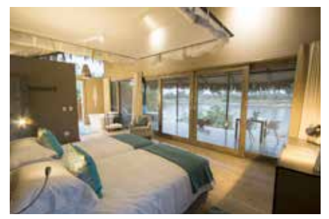
Masuwe Lodge, our preferred partner, victoria Falls, Zimbabwe