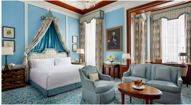
THE LANESBOROUGH London - United Kingdom

Presiding over Hyde Park Corner in the very heart of the British capital, the historic hotel's butler service, modern British dining and award-winning spa and wellbeing facilities unite the best of London life under one roof.