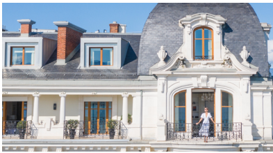
THE WOODWARD Geneva - Switzerland

+44 20 7259 5599 | reservations.lan@oetkercollection.com