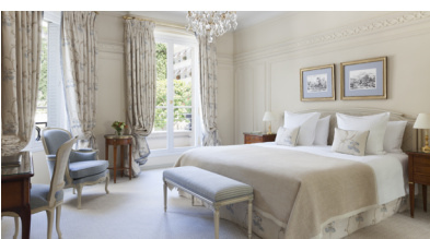
LE BRISTOL PARIS Paris - France

+33 4 79 04 01 04 | reservations.apg@oetkercollection.com