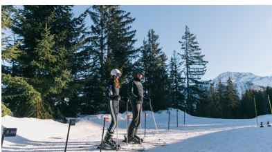
L'APOGÉE COURCHEVEL Courchevel - France

+41 22 901 37 00 | reservations.twg@oetkercollection.com