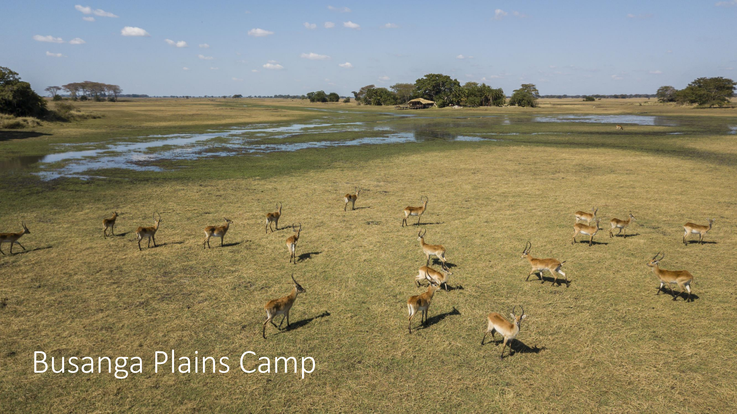
Busanga Plains Camp