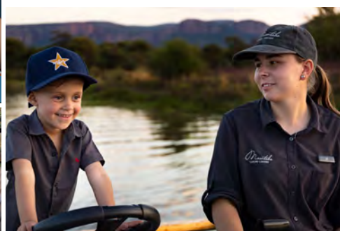
Sailors on Miss Mara boat (>6)