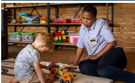
Childminding Services (additional cost)