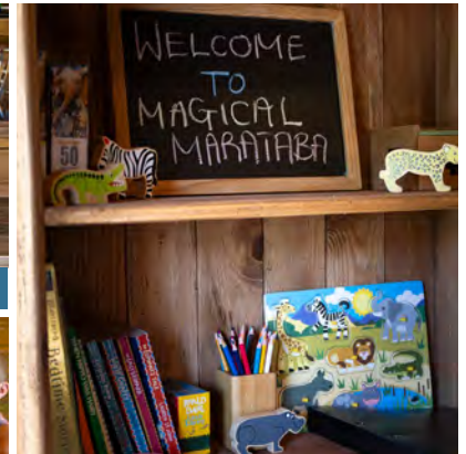
Board games & puzzles