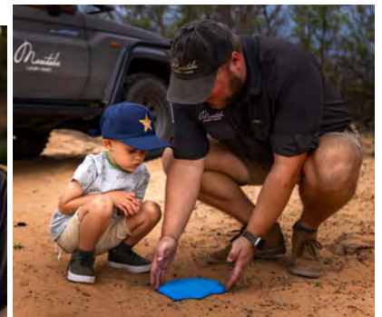
Animal 'Spoor' ID & Mould Casting