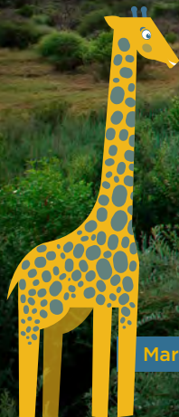
Marataba Safari Lodge - ALL AGES