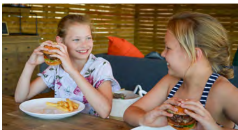
Family Friendly Dining