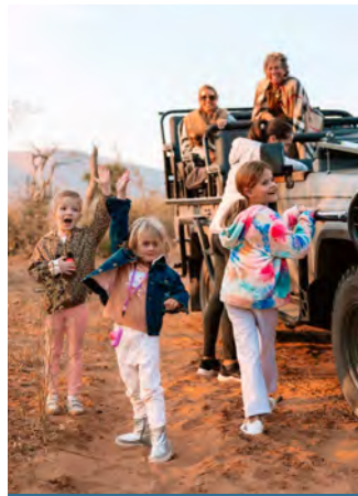
Family Game Drives