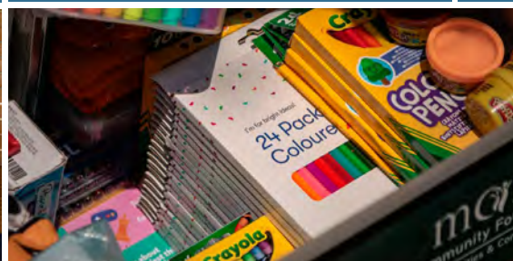
Pack For A Purpose - Support Our School Project