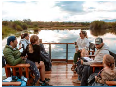
Miss Mara Water Safari