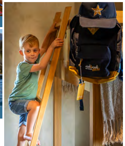
Family Friendly Accommodation