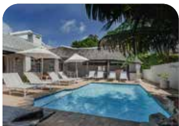
6. COTTAGE PIE VILLA