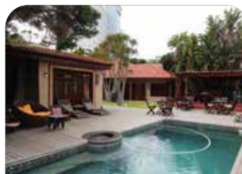
8. SINGA LODGE