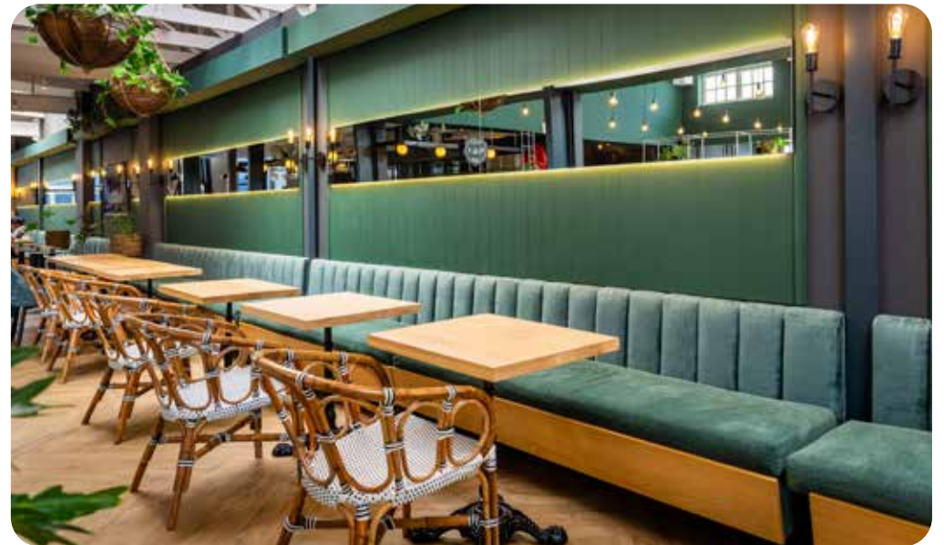
OLD BANK HOTEL