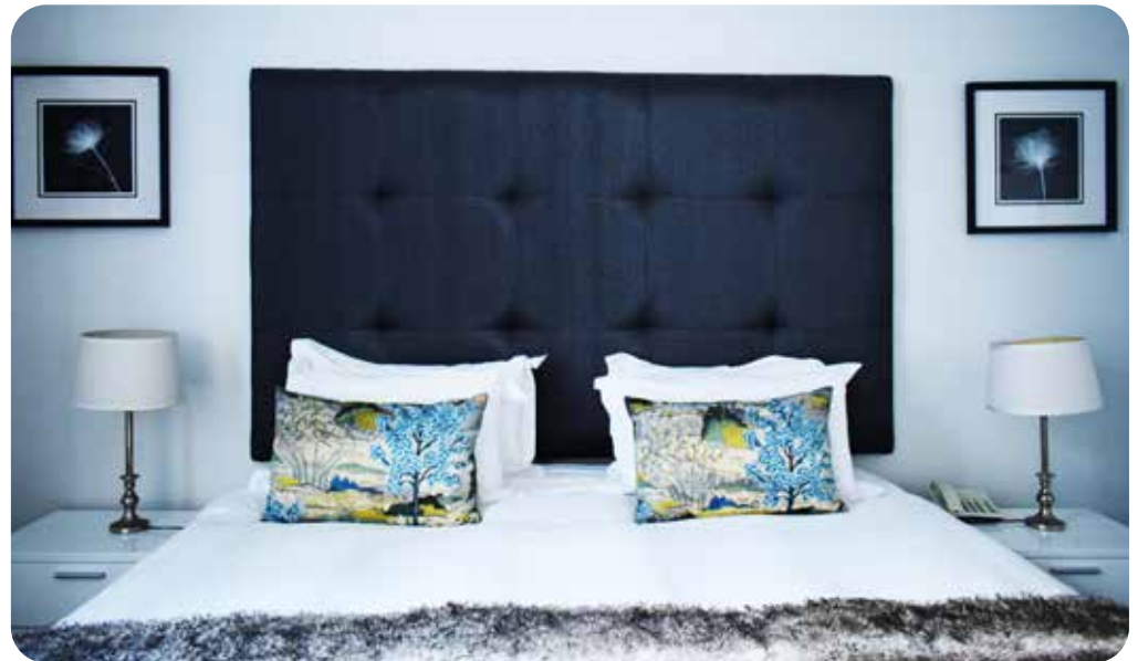
OLD BANK HOTEL