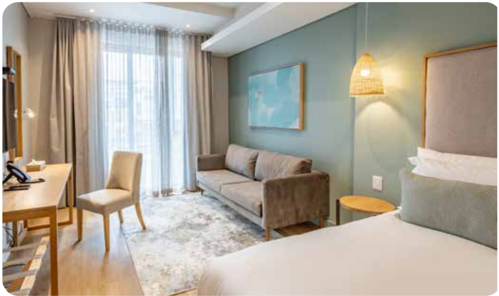
OLD BANK HOTEL