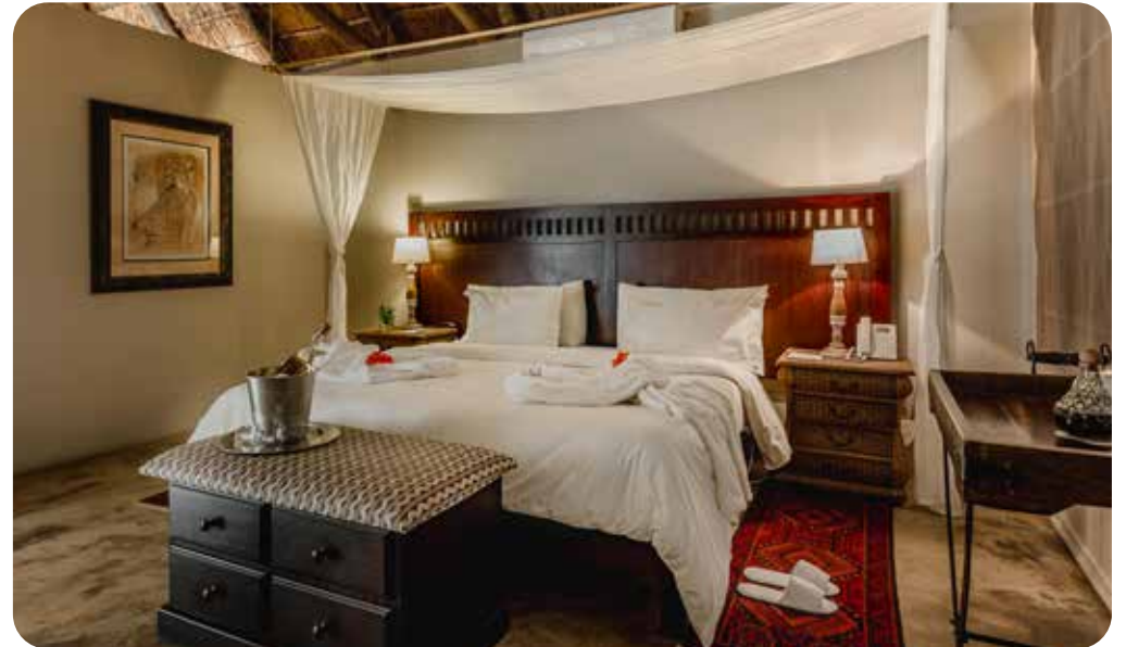
OLD BANK HOTEL