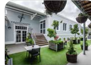
4. FRANSCHHOEK BOUTIQUE