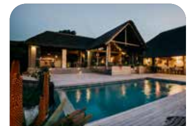
10. BUKELA LODGE