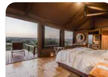
9. HLOSI LODGE