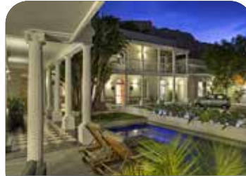
3. THE THREE BOUTIQUE