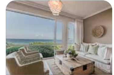
5. THE ROBERG BEACH LODGE