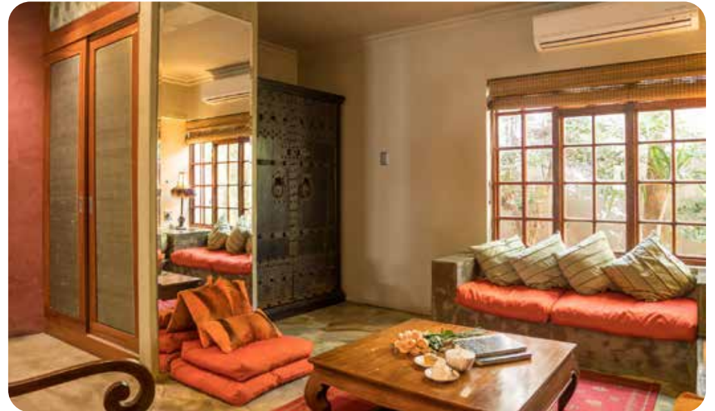
OLD BANK HOTEL