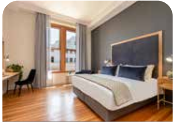
1. OLD BANK HOTEL