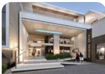
7. PLETT QUARTER HOTEL & APARTMENTS