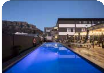
2. KLOOF STREET HOTEL