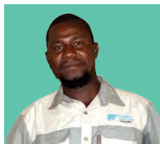
HUSTLER | Poler / Maintenance