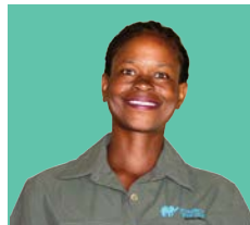
MOS | Scullery / Assistant Chef