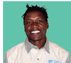
TWAMBA | Groundsman