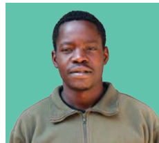
GB | Groundsman