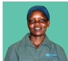
REETILE | Housekeeping