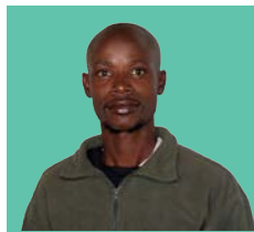
EQ | Guide