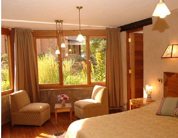
Luxury Single Occupancy $265 Offered with either two queen beds or a single king with an abundance of space for the single traveler.