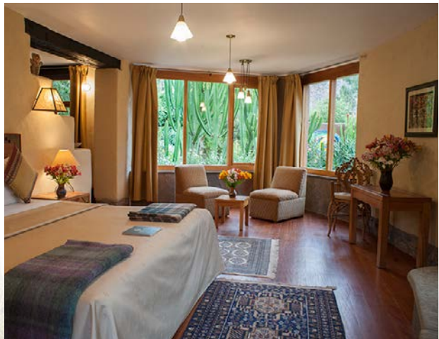
Luxury King $335 Beautiful short-term home for a couple, and perfect choice for a special occasion.