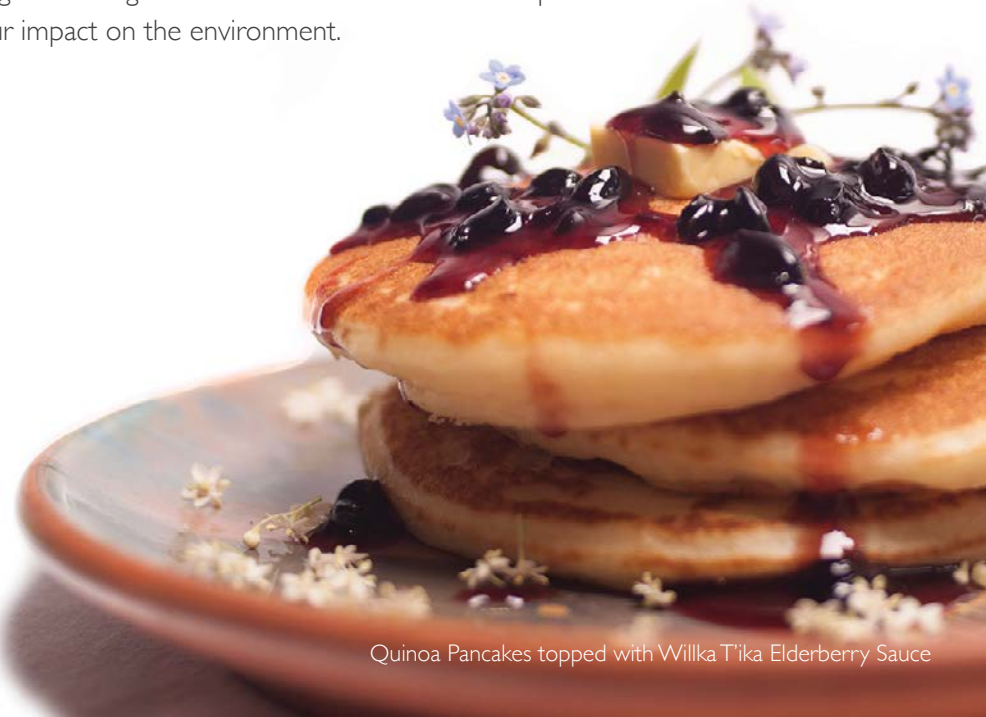
Quinoa Pancakes topped with Willka T'ika Elderberry Sauce