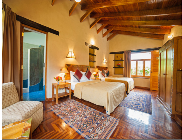
Luxury Double (2 Queens) $335 A top pick for friends to share a spacious tranquil room.