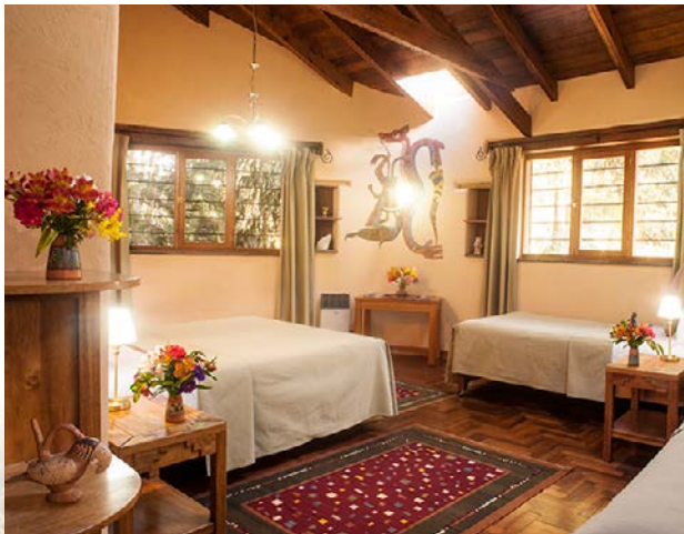
Luxury Triple $399 A combination of 3 beds allow families and friends to harmonize in Andean luxury.