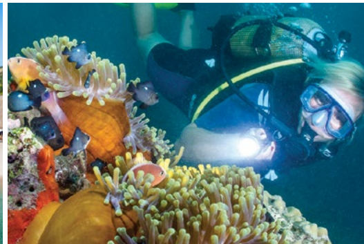
TABLE OF FACTS