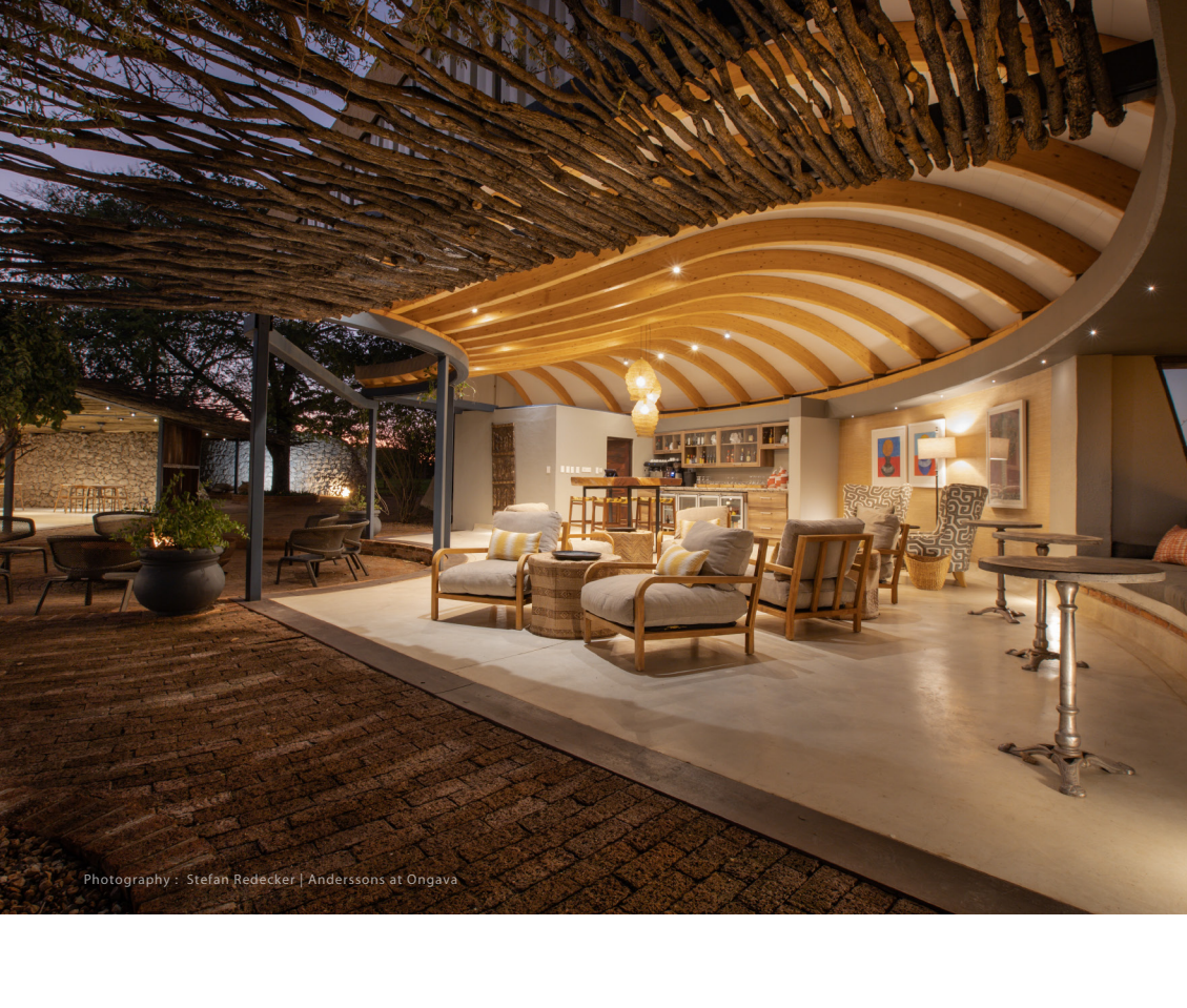
ANDERSSONS AT ONGAVA