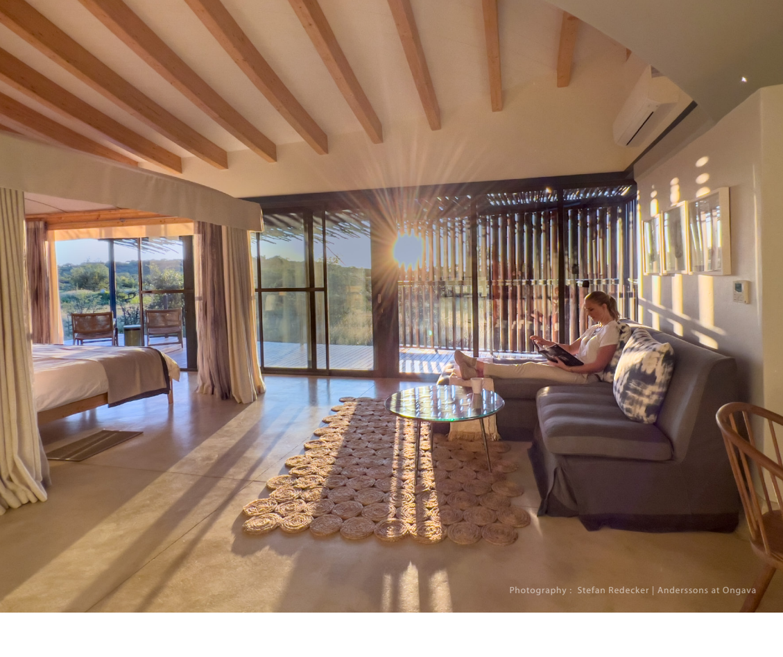
ANDERSSONS AT ONGAVA THE DETAILS