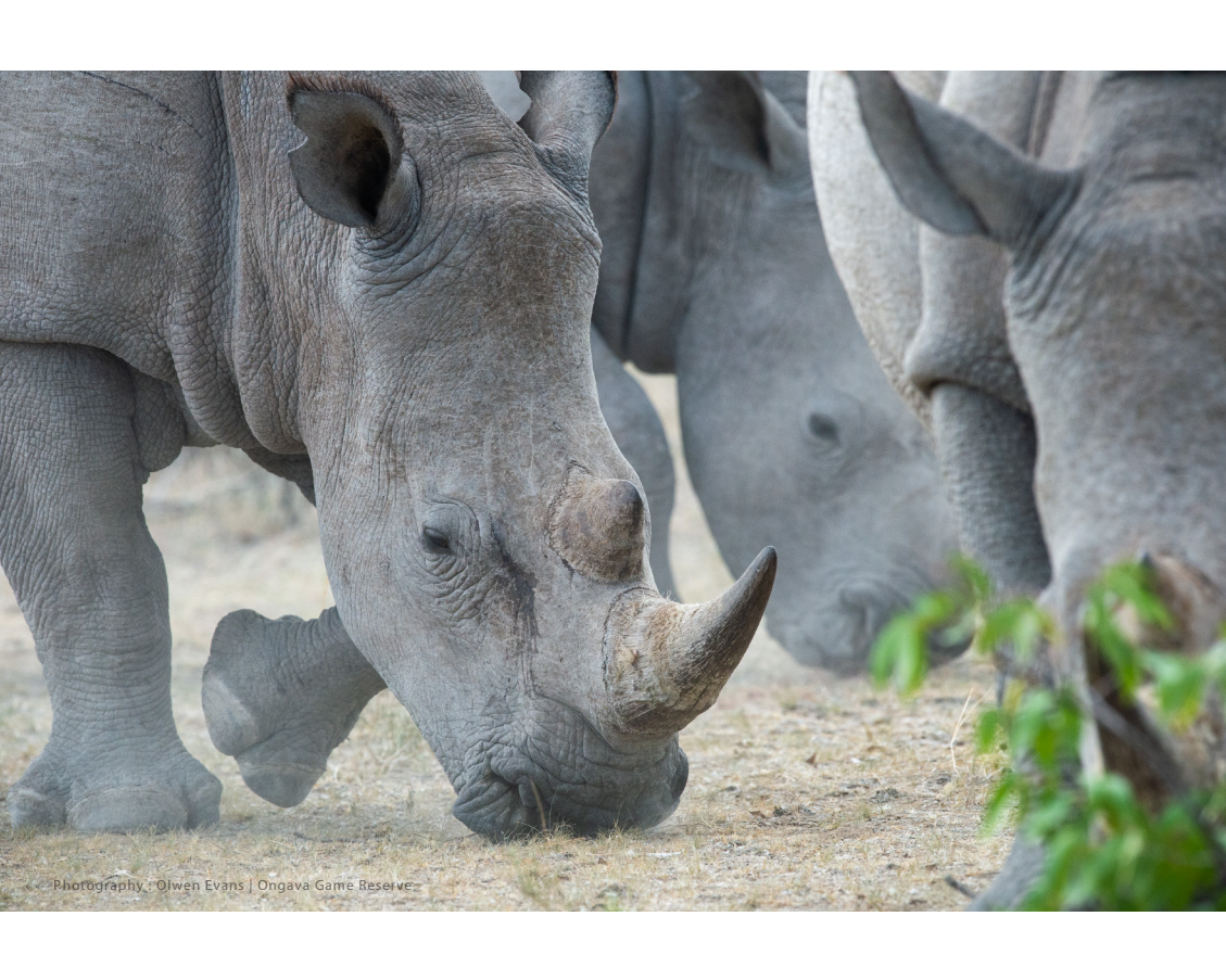
Inspiring, soulful, essential. This is the magic of the African bush.