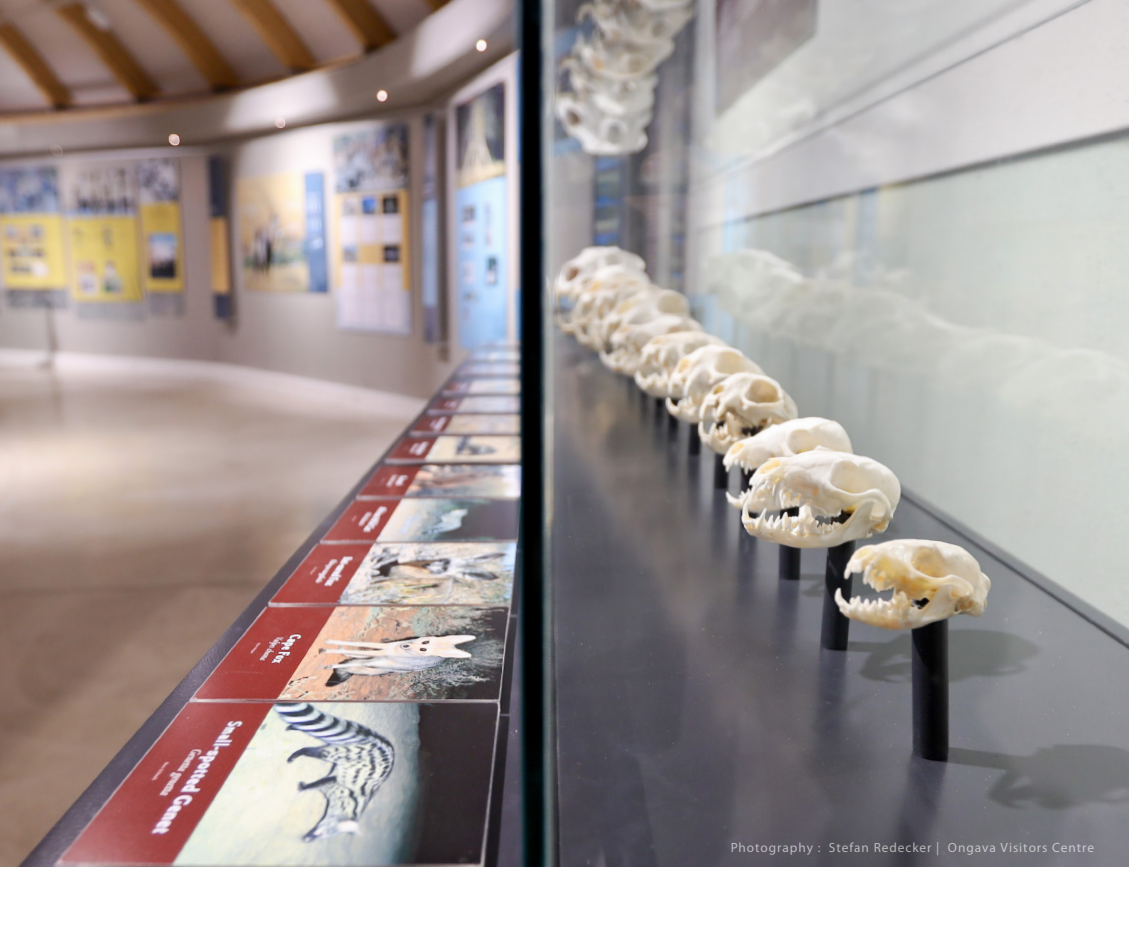
ONGAVA RESEARCH CENTRE