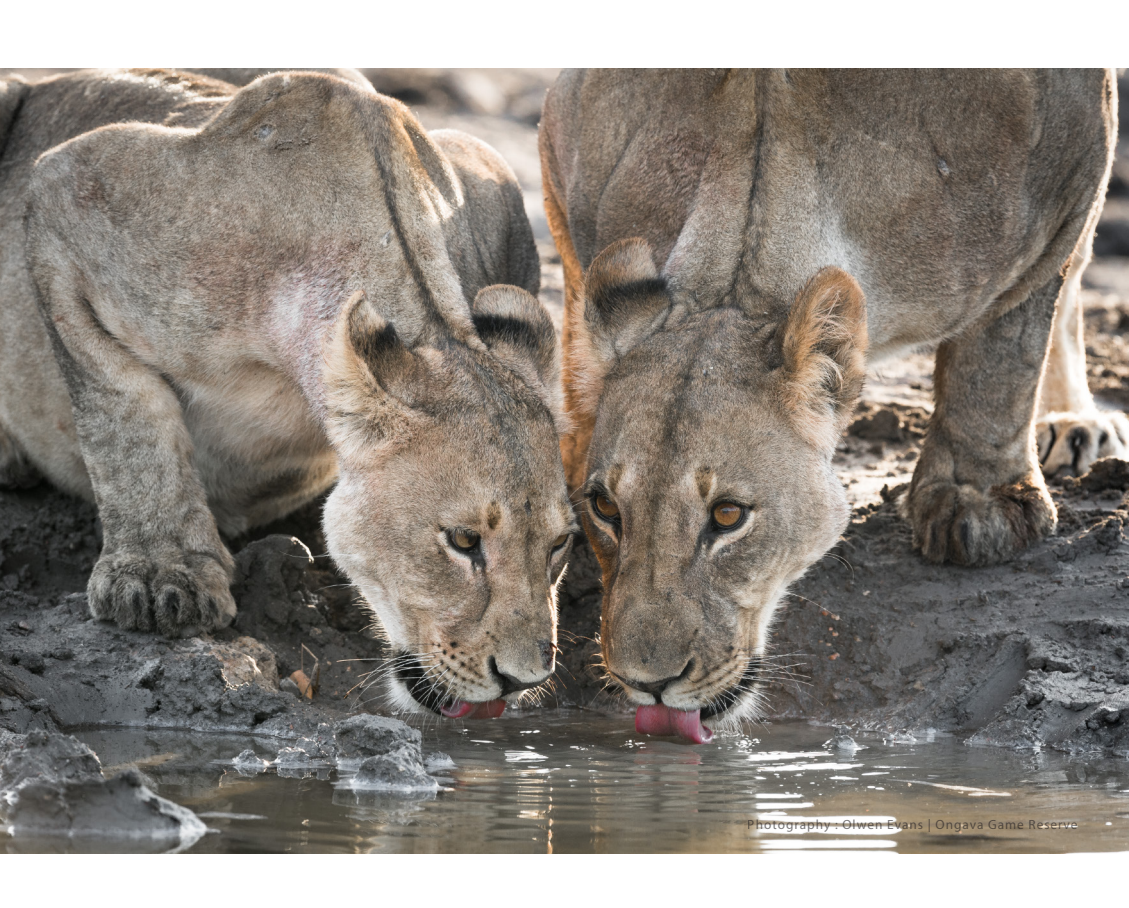
THIS IS ONGAVA