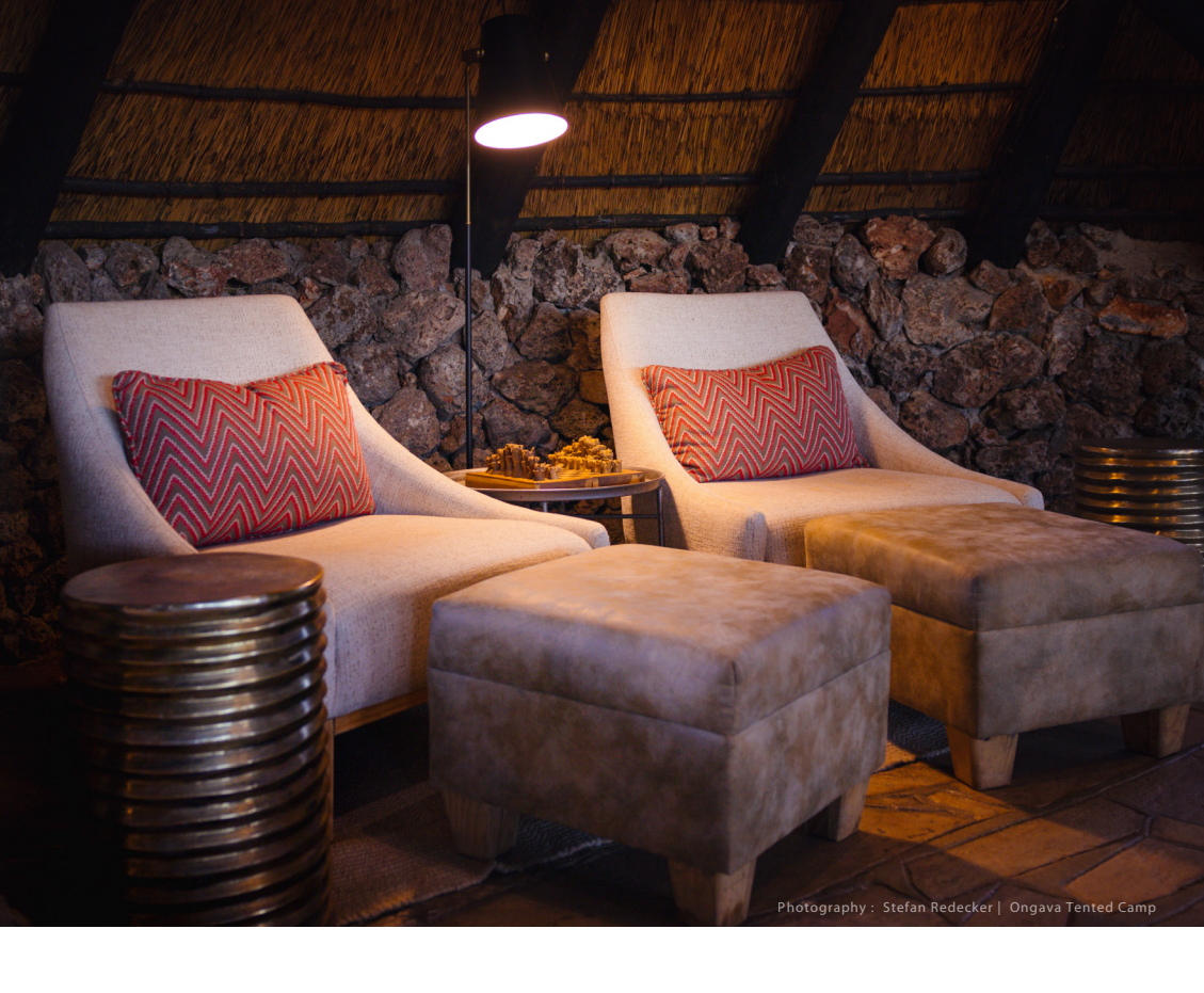
ONGAVA TENTED CAMP