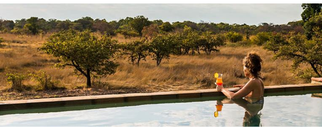
Fig Tree Bush Camp has tented accommodation on 3-meter high platforms above the ground, giving a spectacular view over the lagoon and the surrounding bush. We have 4 en-suite luxury safari tents on stilts (2 twin and 2 double).