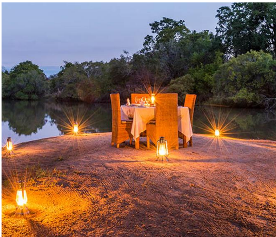
Fig Tree Bush Camp offers superb food and after a three-course supper guests will sit around a campfire, feet in the sand, gazing at the stars and listening to the sounds of the African Bush. Mukambi is famous for its excellent cuisine and friendly staff.