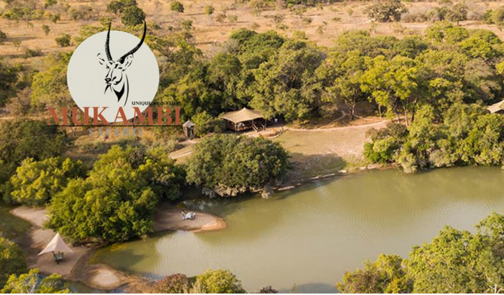
Fig Tree Bush Camp Fact Sheet

In June 2015 Mukambi Safaris opened this new luxury bush camp in an undiscovered part of Kafue National Park. It is named after the giant fig tree next to the boma (central area) overlooking a unique sandy lagoon. This lagoon maintains its alluring water throughout the season attracting an array of wildlife, including elephant, puku, impala, warthog, zebra, and hartebeest. Predators like lion, cheetah, leopard and hyena are regular visitors and the wild dog have been known to prey on the concentration of game.