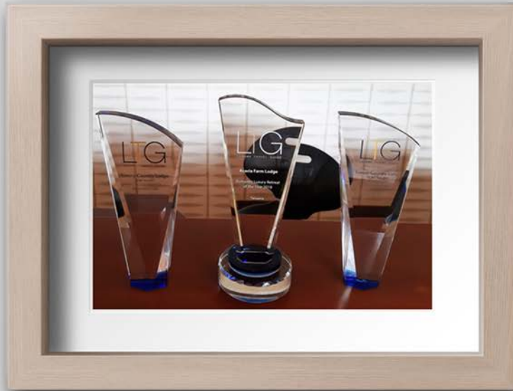
Luxury Travel Guide Awards - 3 years in a Row 2016 | 2017 | 2018