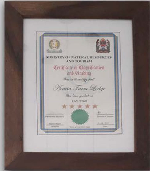
5-STAR Rated Lodge