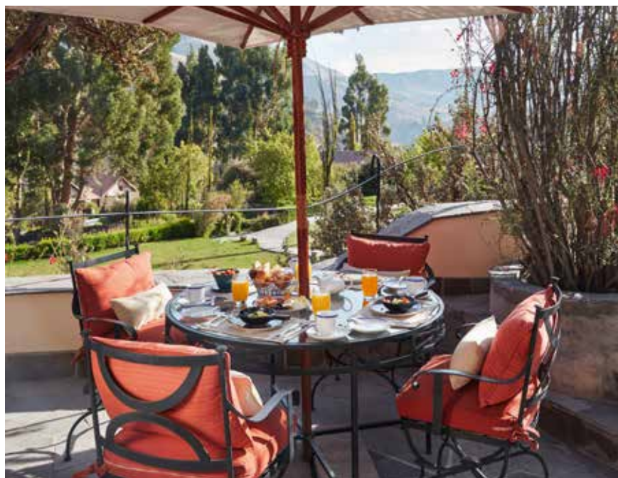
LAS CASITAS, A BELMOND HOTEL, COLCA CANYON