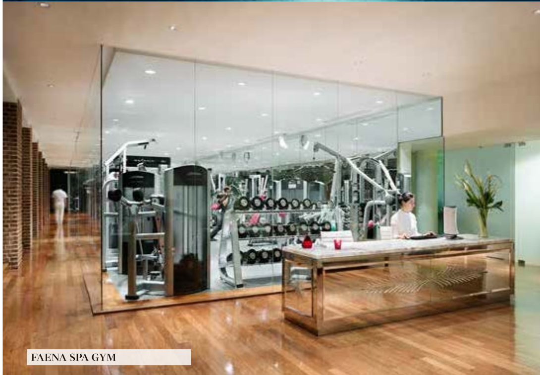
FAENA SPA GYM