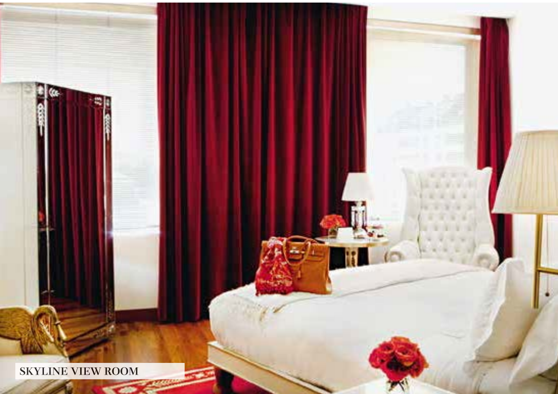
SKYLINE VIEW ROOM