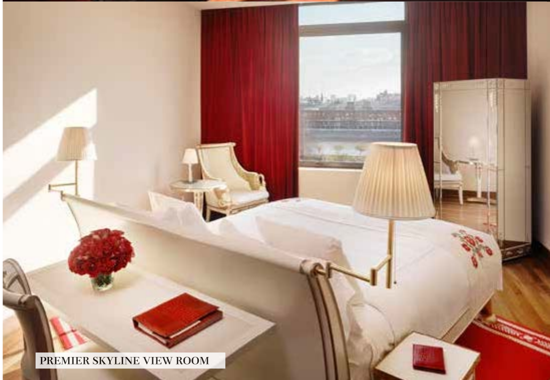
PREMIER SKYLINE VIEW ROOM