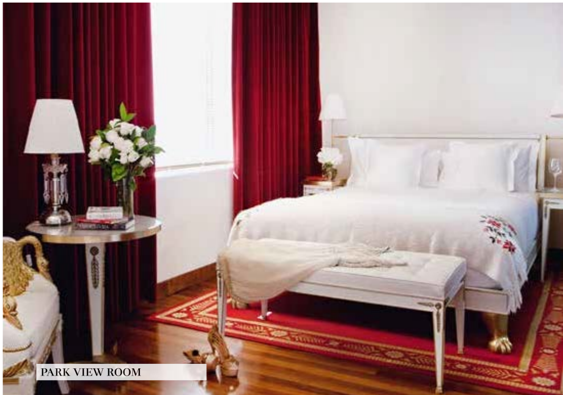
PARK VIEW ROOM