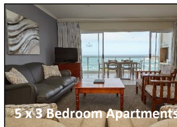
5 x 3 Bedroom Apartments