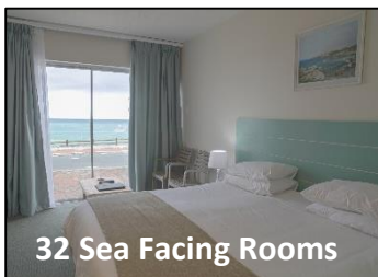
32 Sea Facing Rooms