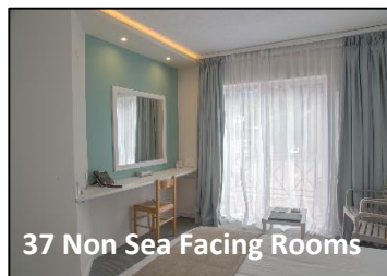
37 Non Sea Facing Rooms