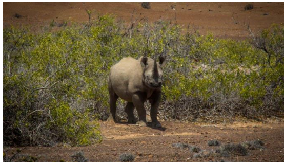
DORO JMA CONSERVATION AREA