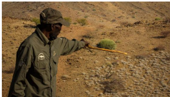
PACK FOR CONSERVATION

24-hour emergency: +264 81 141 2275 • Tel: +264 61 248137 • info@ultimatesafaris.na