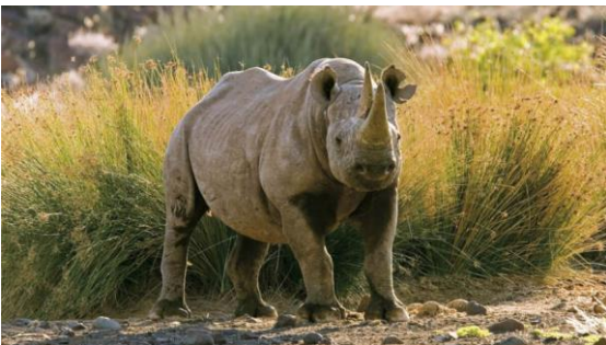
SAVE THE RHINO TRUST (SRT)