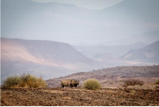
DESERT-ADAPTED RHINO ACTIVITY