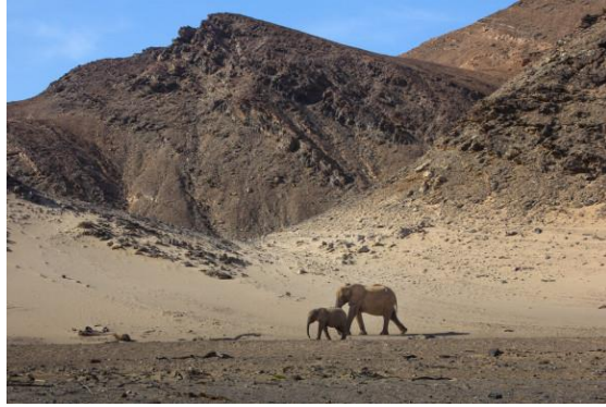
DESERT-ADAPTED ELEPHANT ACTIVITY