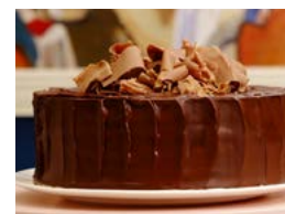
Chocolate Fudge Ganache - R490