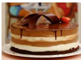
Chocolate Mousse Cake - R550