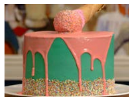
Birthday Cake - R650

Would you like to add a message on the cake? _____