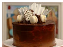
Chocolate Macaroon Cake - R590