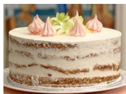
Naked Cake - R450