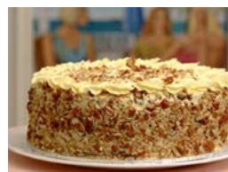
Carrot Cake - R490