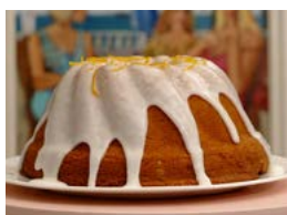
Lemon Drizzle - R390

All cakes are 24cm (16 slices). Kindly note that 24 hours notice is required with orders. Please check the boxes next to the items you wish to select.