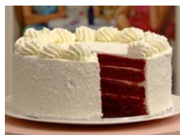
Red Velvet and Coconut - R450