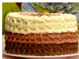
Chocolate, Vanilla or Red Velvet - R600