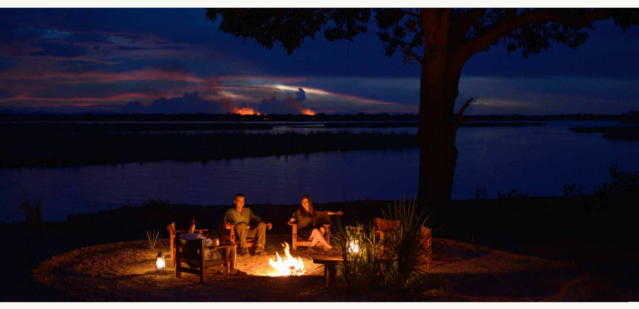
LOWER ZAMBEZI NATIONAL PARK - ZAMBIA