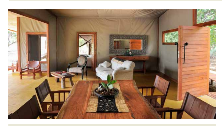
Luxury Family House