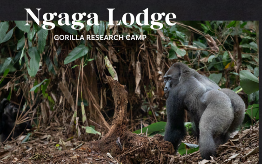
Hidden in a dense, nearly inaccessible forest, Ngaga is one of Africa's most remarkable lodges, offering the rare opportunity to

visit gorillas in a habitat barely touched by humanity.