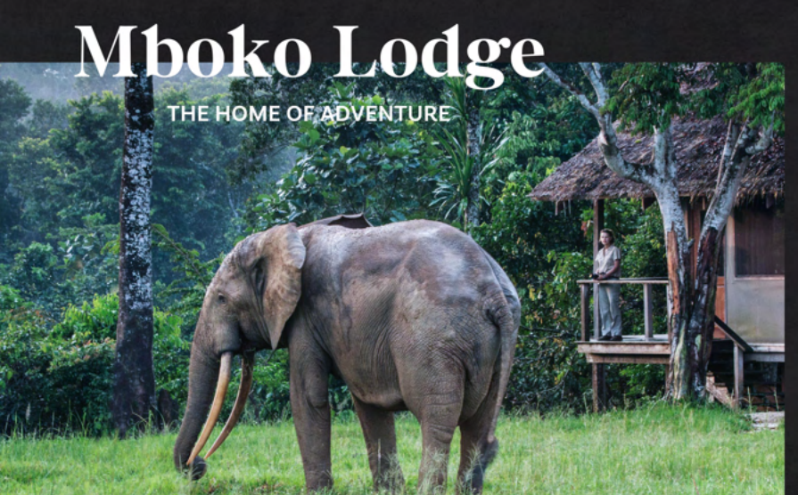
Set at the intersection of savanna, forest, and river, Mboko provides a front-row seat to the staggering diversity of the Congolese ecosystem. Every day at Mboko brings a new