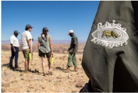
PACK FOR CONSERVATION