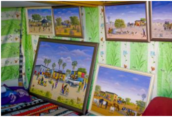
WINDHOEK 'REDEFINED' TOUR