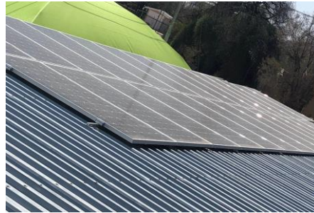
STAINABLE MANAGEMENT PRACTICES