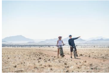
WINDHOEK MOUNTAIN BIKING