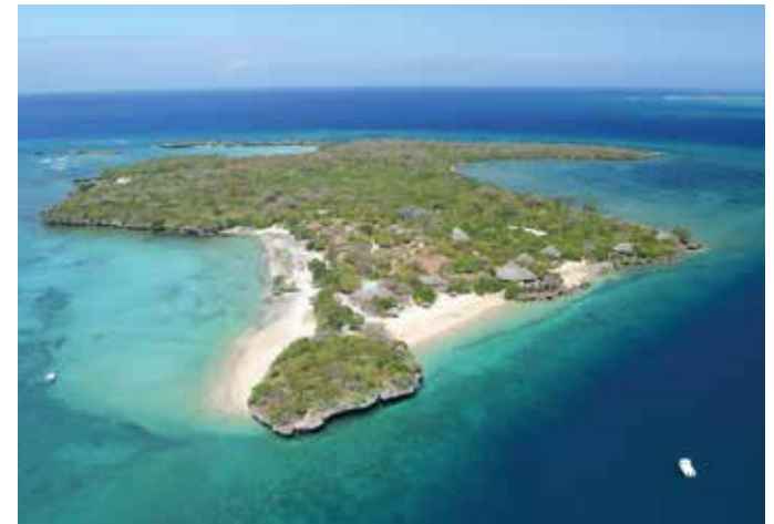
AZURA QUILALEA PRIVATE ISLAND Mozambique

reservations@azura-retreats.com +27 (0)11 467 0907 www.azura-retreats.com