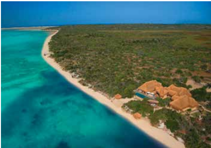
AZURA BENGUERRA ISLAND Mozambique