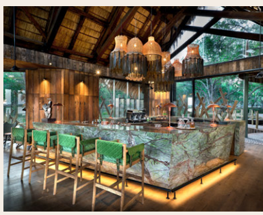
Updated: October 10, 2024