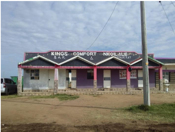
Turning point at Nkoilale Town as you head to Naboisho Conservancy and the Talek River.

Leaving Narok take the left turn towards Sekenani Gate. You are headed for Nkoilale town 73kms away, the road is tarmac until Maji Moto and then becomes rough murrum. Nearing Nkoilale you will drive past an Ol Kinyei Conservancy sign post on your right. Cross the bridge and continue driving a few kms to Nkoilale town, a small collection of buildings either side of the road. Turn off to the right in the centre, heading west towards Naboisho Conservancy and the Talek River.