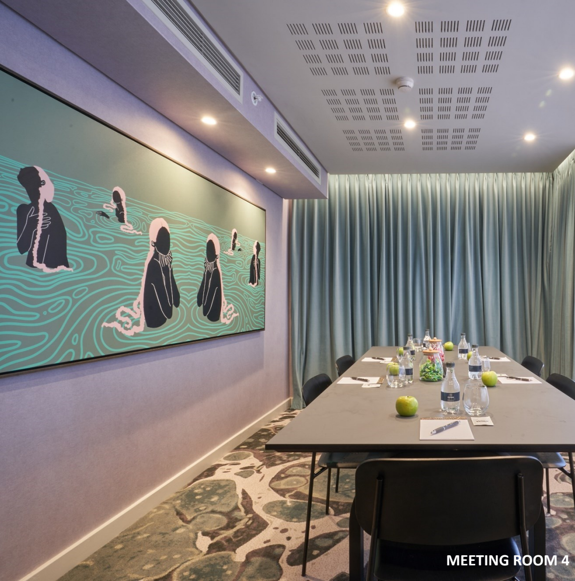
MEETING ROOM 4