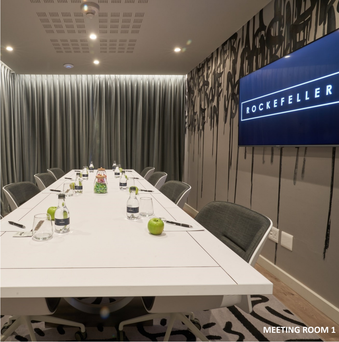
MEETING ROOM 1