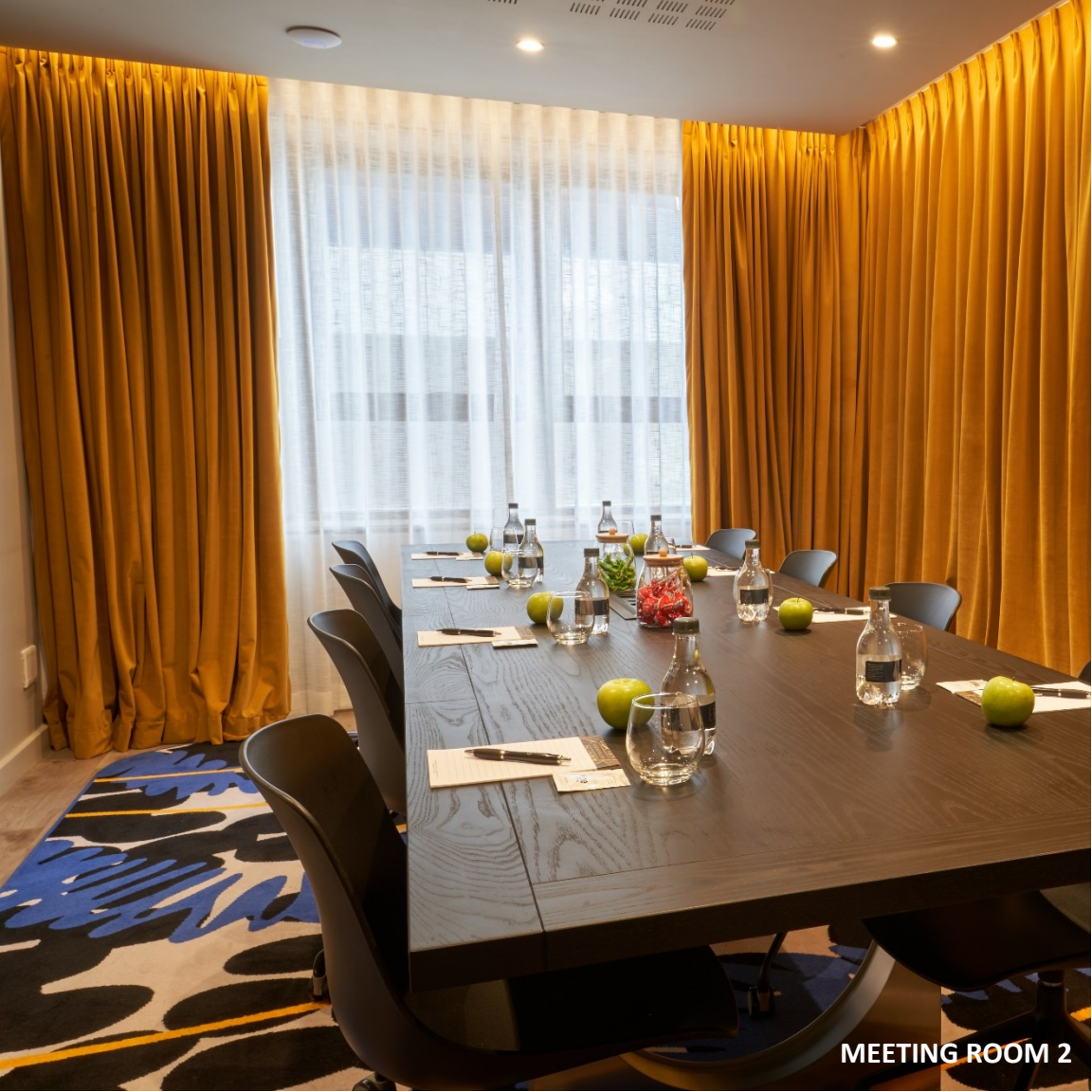
MEETING ROOM 2