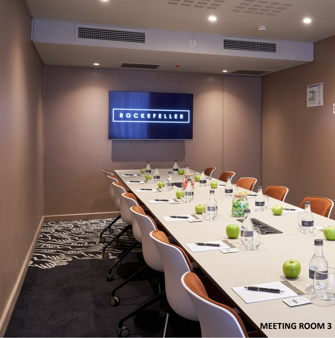
MEETING ROOM 3