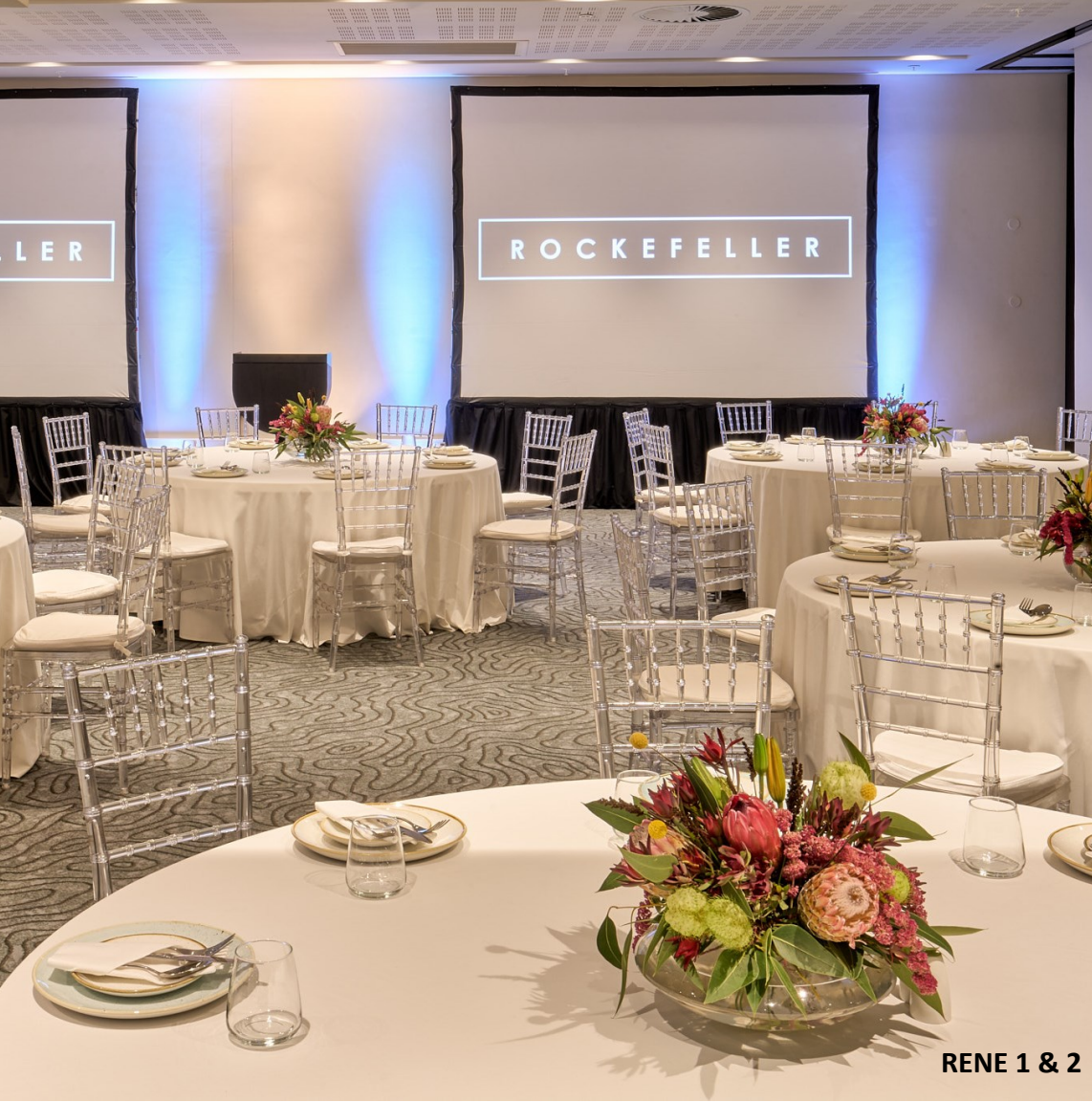
RENE 1 & 2