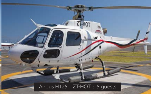
Airbus H125 – ZT-HOT : 5 guests