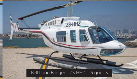
Bell Long Ranger – ZS-HHZ : 5 guests