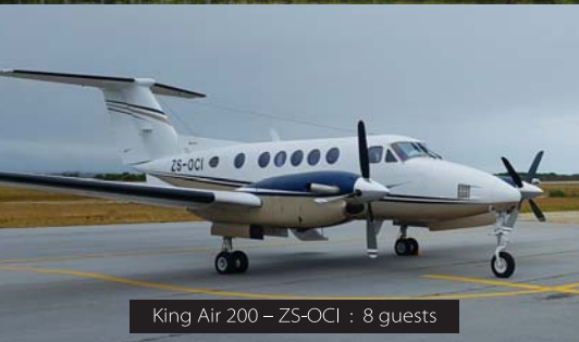
King Air 200 – ZS-OCI : 8 guests