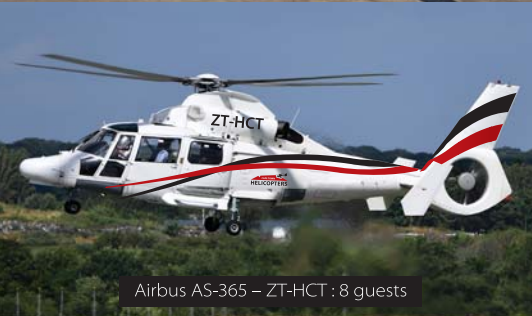
Airbus AS-365 – ZT-HCT : 8 guests