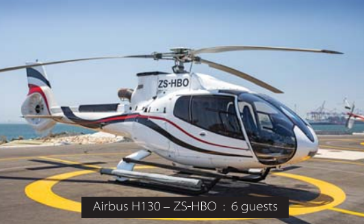
Airbus H130 – ZS-HBO : 6 guests