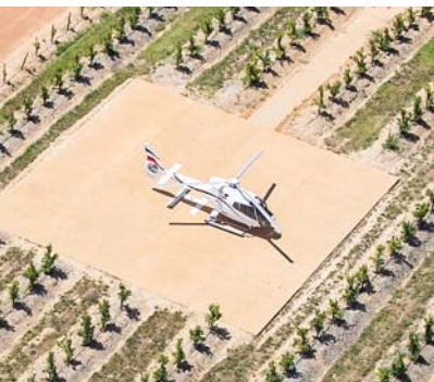
Babylonstoren FRANSCHHOEK VALLEY