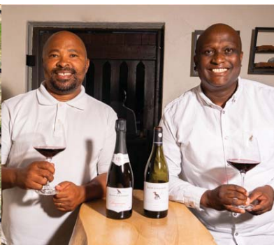
Klein Goederust FRANSCHHOEK