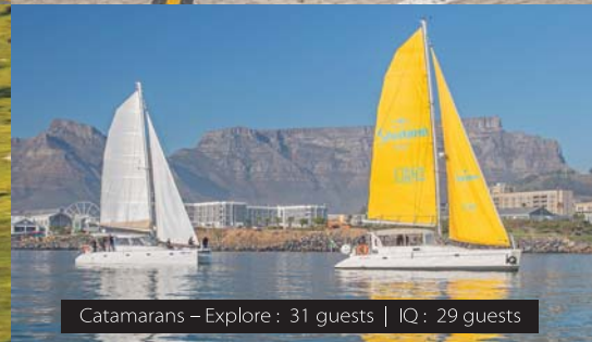
Catamarans – Explore : 31 guests | IQ : 29 guests