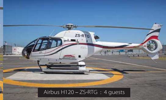
Airbus H120 – ZS-RTG : 4 guests