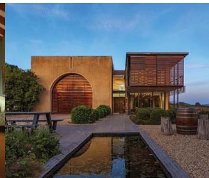
Almenkerk ELGIN VALLEY