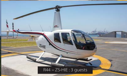
R44 – ZS-HIE : 3 guests