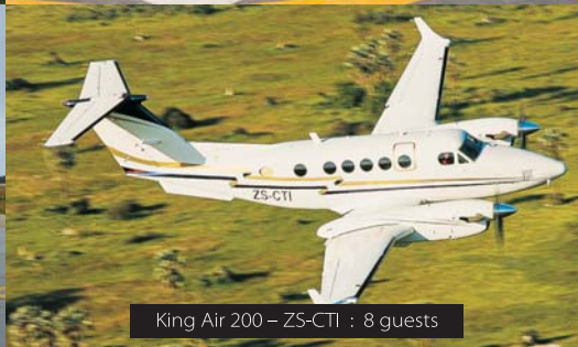
King Air 200 – ZS-CTI : 8 guests