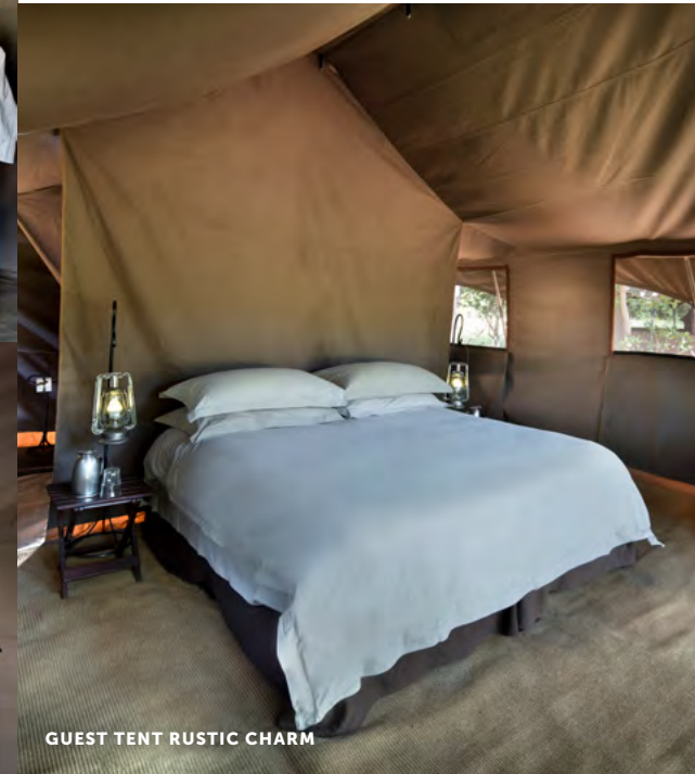
GUEST TENT RUSTIC CHARM