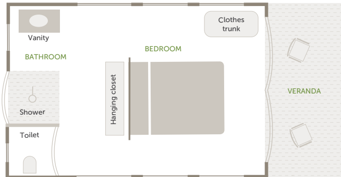
Typical Tent layout