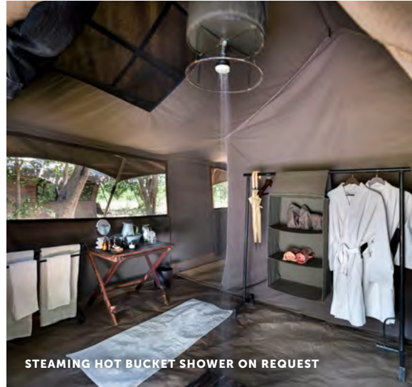
STEAMING HOT BUCKET SHOWER ON REQUEST

&Beyond Savute Under Canvas features five spacious mobile tents, each with an ensuite bathroom, separate flushing WC, and steaming hot bucket shower.