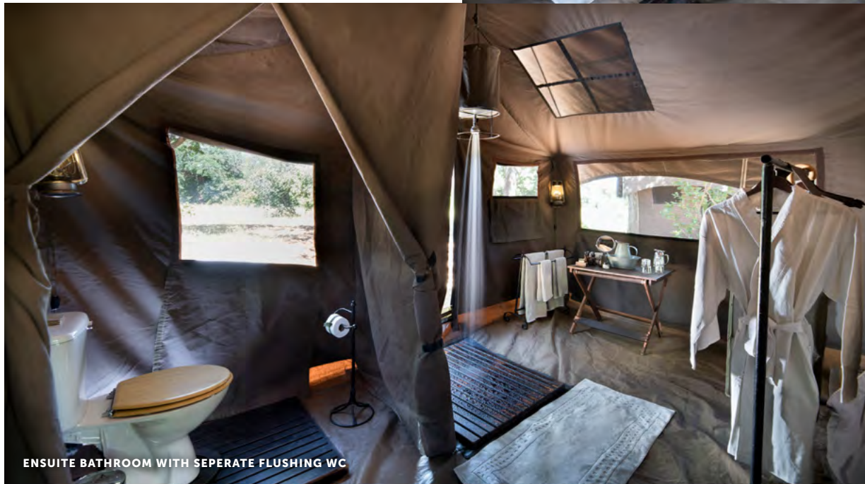
ENSUITE BATHROOM WITH SEPERATE FLUSHING WC