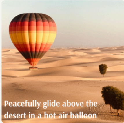
Peacefully glide above the desert in a hot air balloon

As the sun wakes up and warms the horizon, picture yourself floating serenely in a hot air balloon above an ancient desert landscape, timeless beautiful.