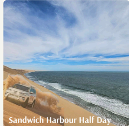
Sandwich Harbour Half Day

At first glance, the dunes of the Namib Desert between Walvis Bay and Swakopmund may seem impressive yet somewhat barren. However, one would be amazed by the diversity and abundance of species in this ecosystem when viewed through the lens of a true Namibian expert.