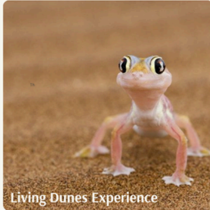
Living Dunes Experience

As the sun wakes up and warms the horizon, picture yourself floating serenely in a hot air balloon above an ancient desert landscape, timeless beautiful.