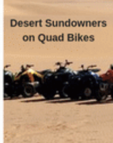
Desert Sundowners on Quad Bikes