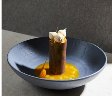
Tasting Menus pg.20