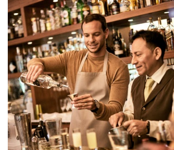
Ceviche and Pisco Sour Demonstration pg.26