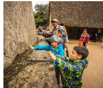
Sumaq Kids Experiences pg.37