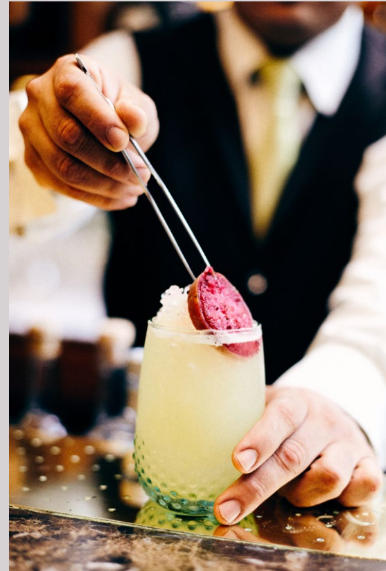
Inti Raymi Cocktail