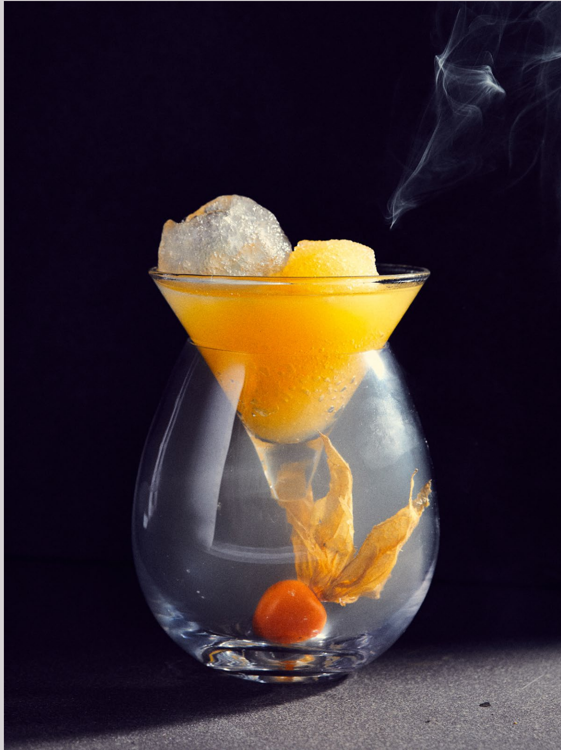
Restaurant & Bar