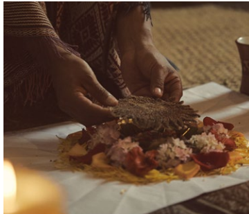
Offering to the Earth or Pachamama Ritual pg.30