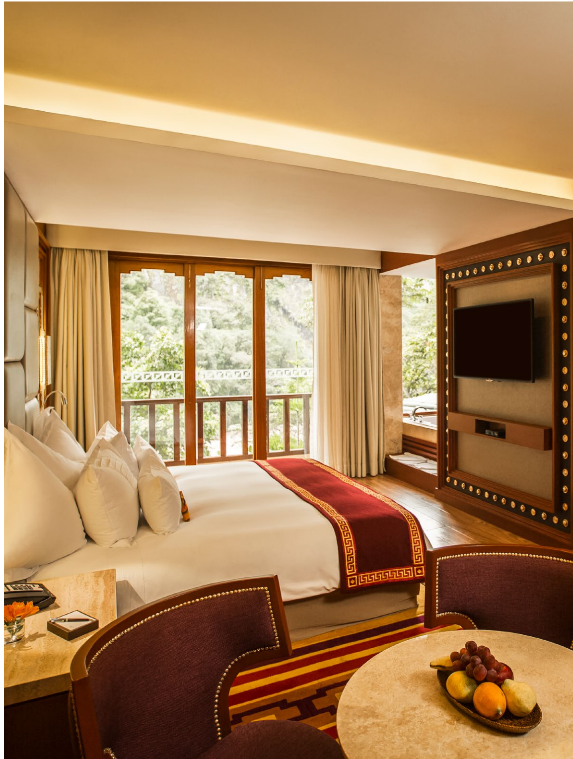
JUNIOR SUITE DELUXE