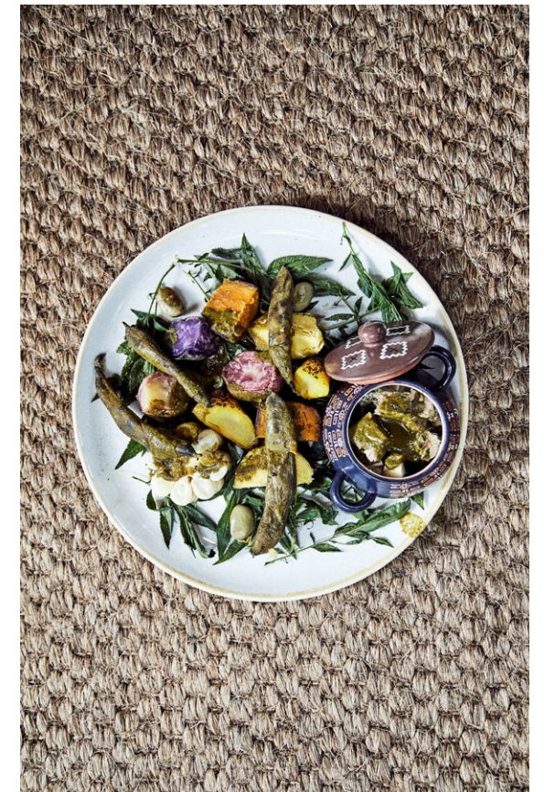
Dish from the Sumaq style Pachamanca, decorated with fresh huacatay leaves.

In addition to the Pachamanca, our visitors will be able to taste the typical drink of Cusco, since the time of the Incas, La Chicha or "aswa" in Quechua, is a fermented drink that was offered in ceremonial events and that today continues to be offered in Cusco houses.