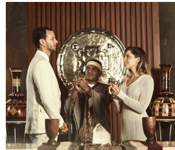
Andean Wedding Arac Masin pg.32