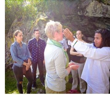
Mystical tour to Machu Picchu pg.33