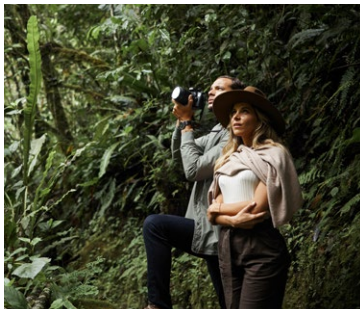
Walks in Nature pg.36