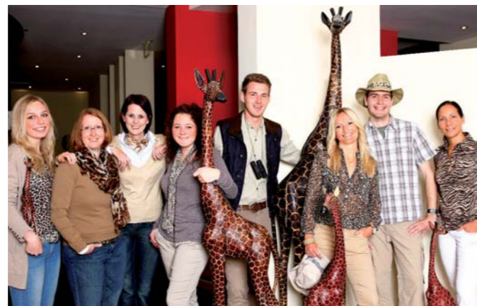
The sales team of Severin Travel in Sundern.