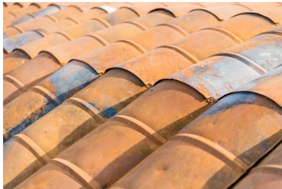
REUSED, RECYCLED & COMPLETELY SUSTAINABLE