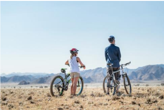
MOUNTAIN PLUS BIKING