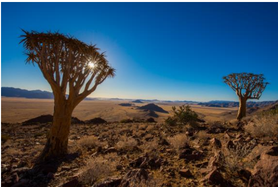
NAMIB TSARIS CONSERVANCY