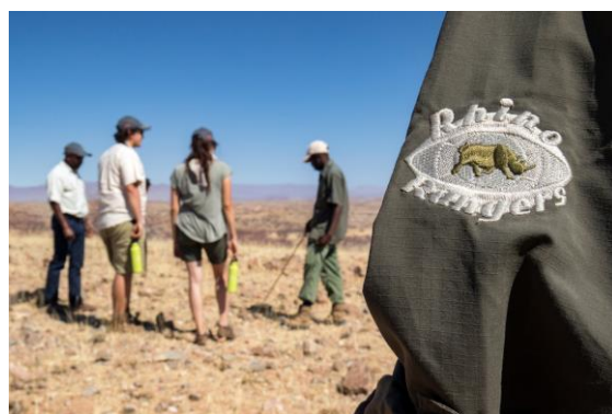
PACK FOR CONSERVATION