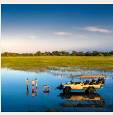
Updated: July 16, 2024