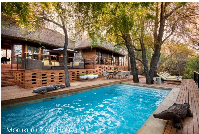
Morukuru River House

Electricity at all 3 houses in Madikwe is generated by solar panels, with a back-up generator just in case. We are not relying on the national grid for power.