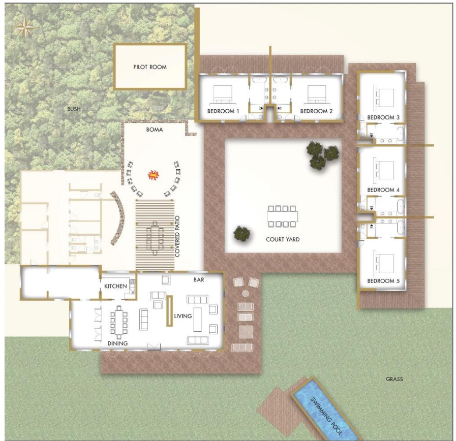
Farm House – 940 m 2 Bedroom sizes (including bathroom) – 52 m 2