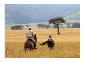
OFFBEAT RIDING SAFARIS

8 rooms in a lodge near Lake Nakuru National Park