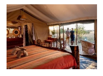
OFFBEAT MARA CAMP

6 cottage lodge in Laikipia, Sosian Ranch