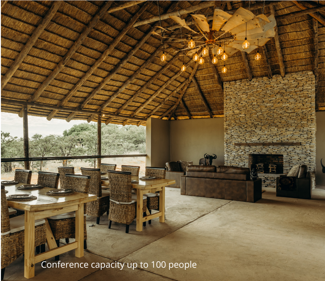
Conference capacity up to 100 people