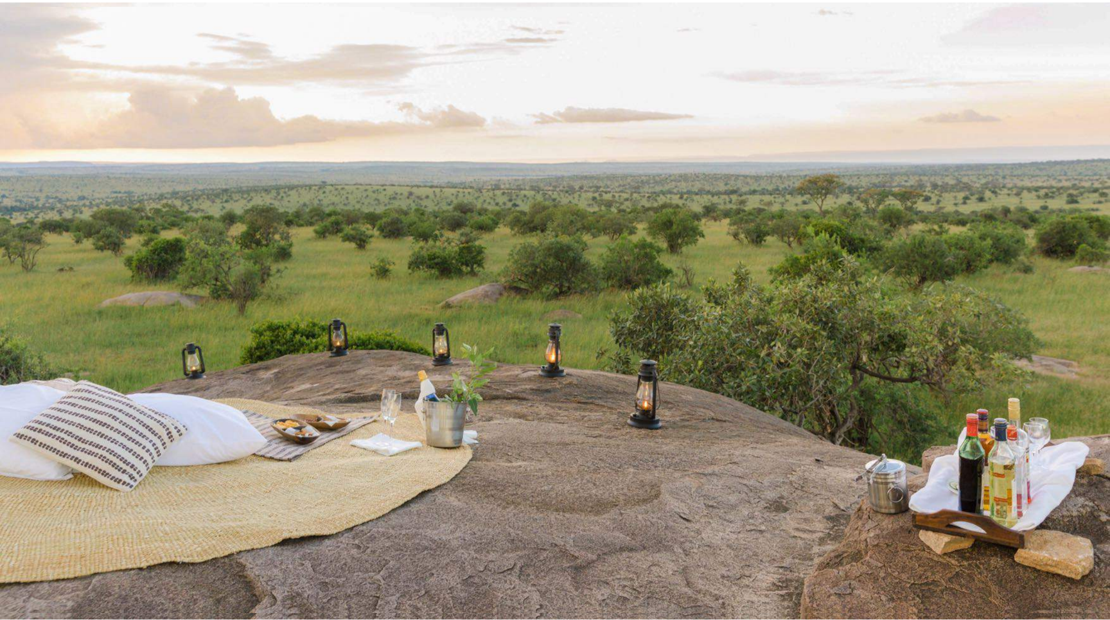
SUNDOWN. ONE OF THE MOST MAGICAL MOMENTS IN THE BUSH.